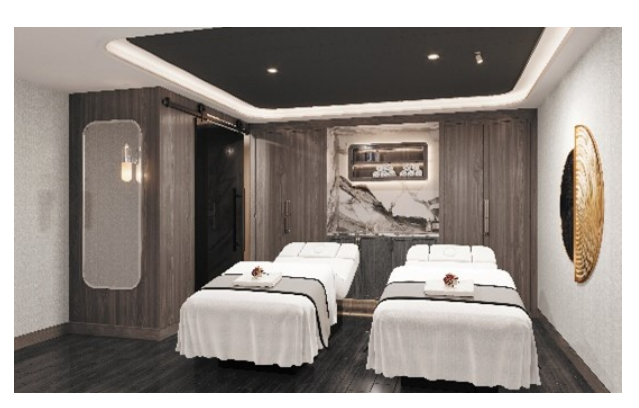
Serene Spa & Wellness Treatment Room

MIAMI, August 15, 2023 – Regent Seven Seas Cruises, the world's leading luxury ocean cruise line, has revealed new and exclusive spa treatments that will debut on board Seven Seas Grandeur ™, setting sail November 2023. The ship's Serene Spa & Wellness ™ experience will enhance relaxation at sea with an indulgent treatment menu that integrates best-in-class techniques and luxury ingredients from around the world, including new treatments utilizing the restorative power of an amber and quartz crystal bed, and an advanced treatment table for a Zero Gravity Wellness Massage .