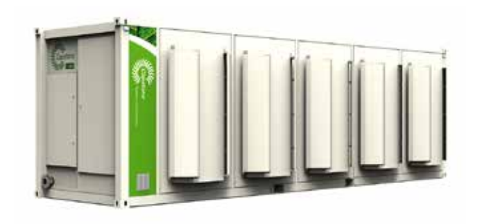
A C1000R Microturbine provides up to 1 MW of electrical power and contains 5 microturbine engines.