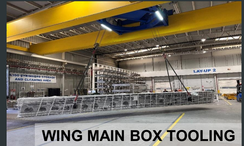
WING MAIN BOX TOOLING