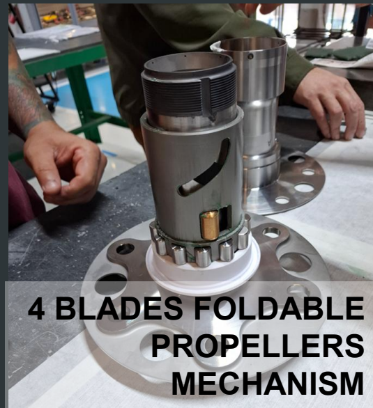
4 BLADES FOLDABLE PROPELLERS MECHANISM