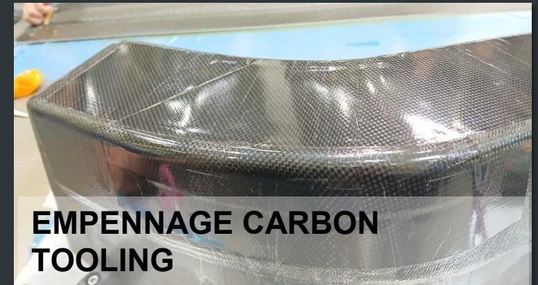
EMPENNAGE CARBON TOOLING