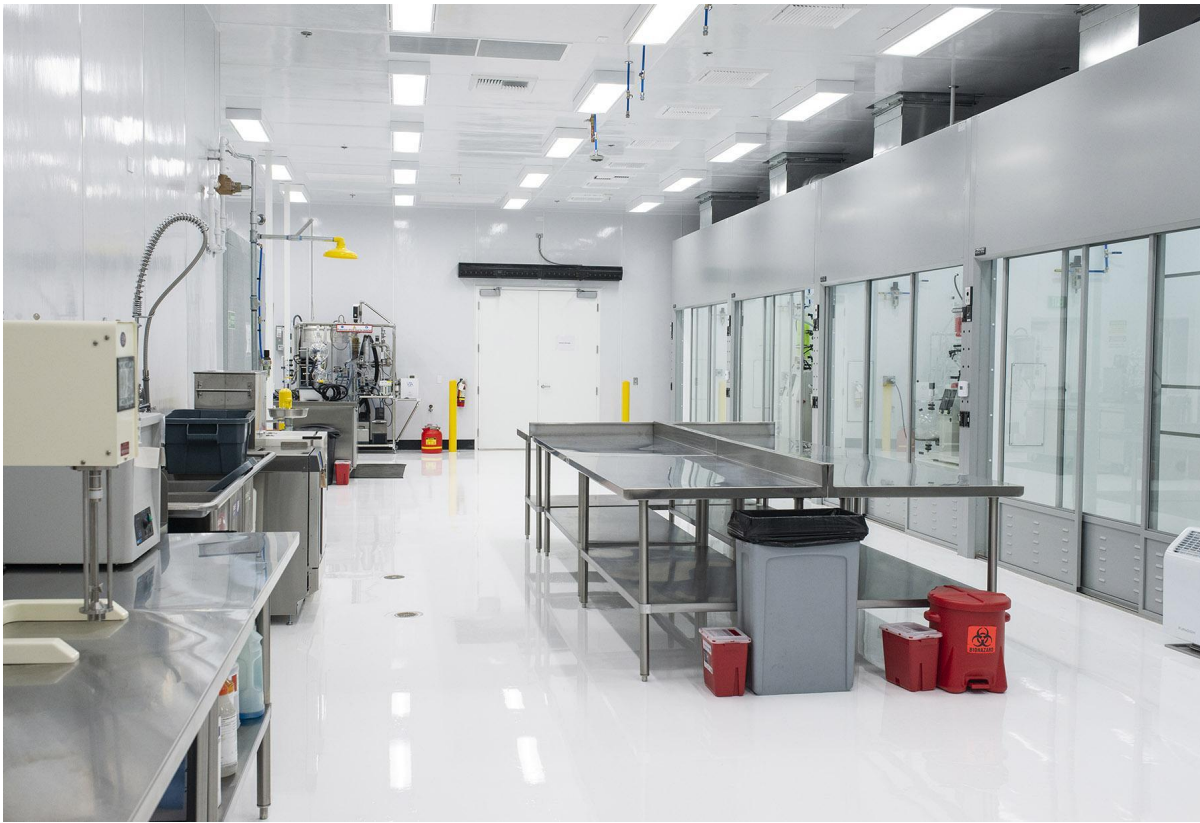
Photo: City Trees production facility, Las Vegas, NV