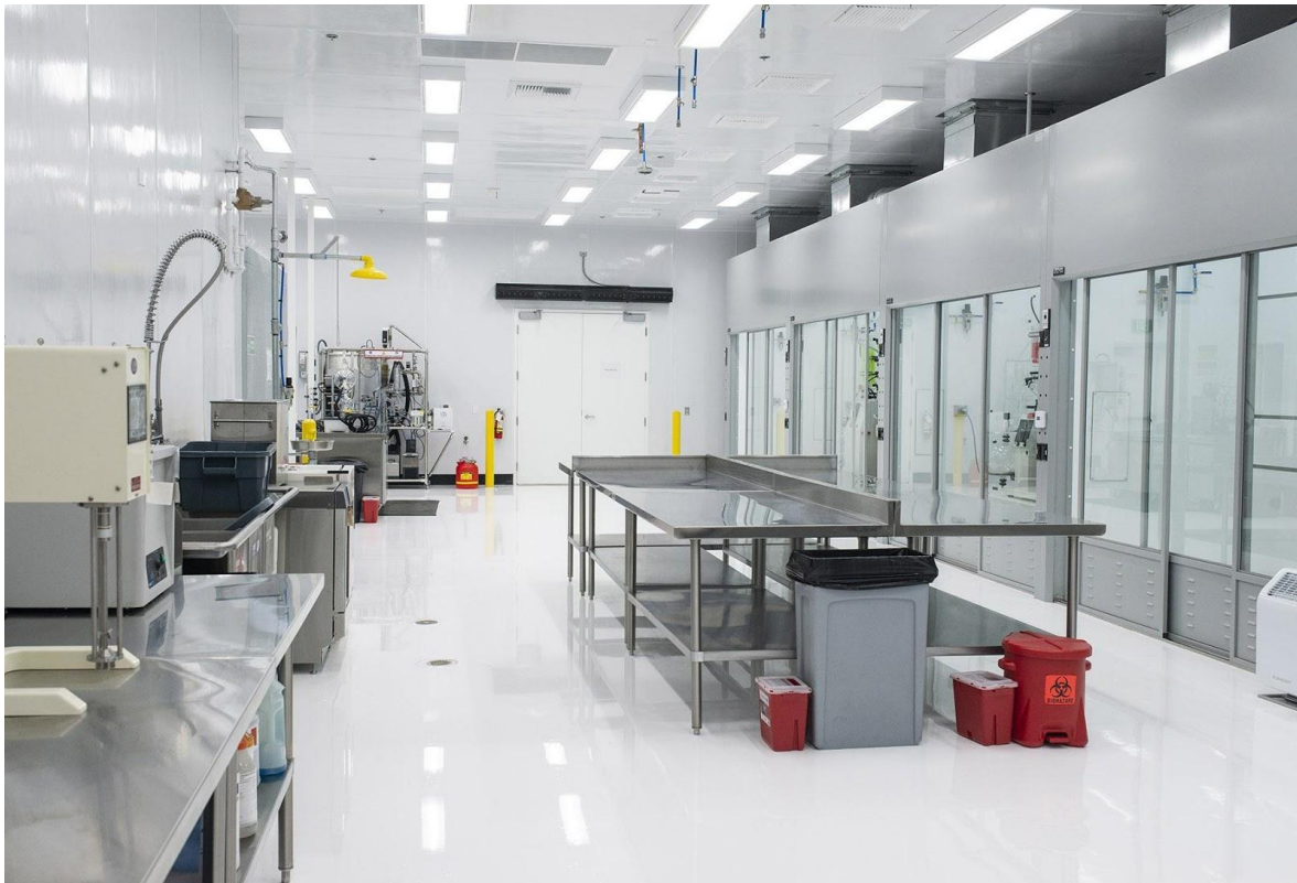
Photo: City Trees production facility, Las Vegas, NV