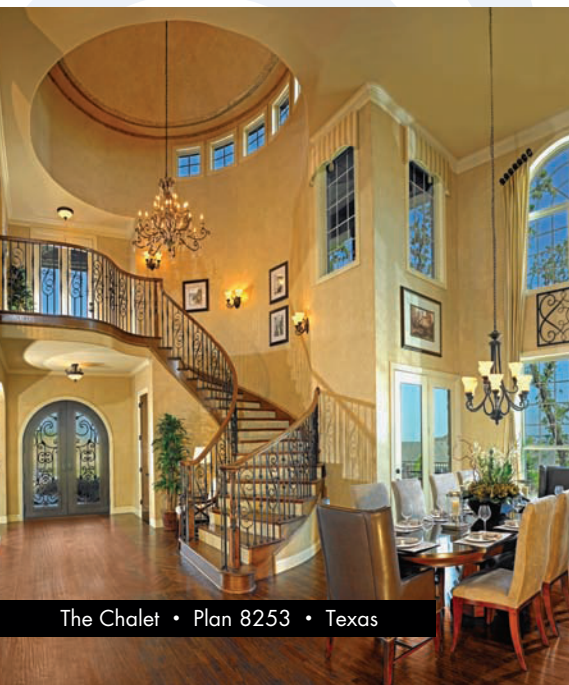
The Chalet • Plan 8253 • Texas