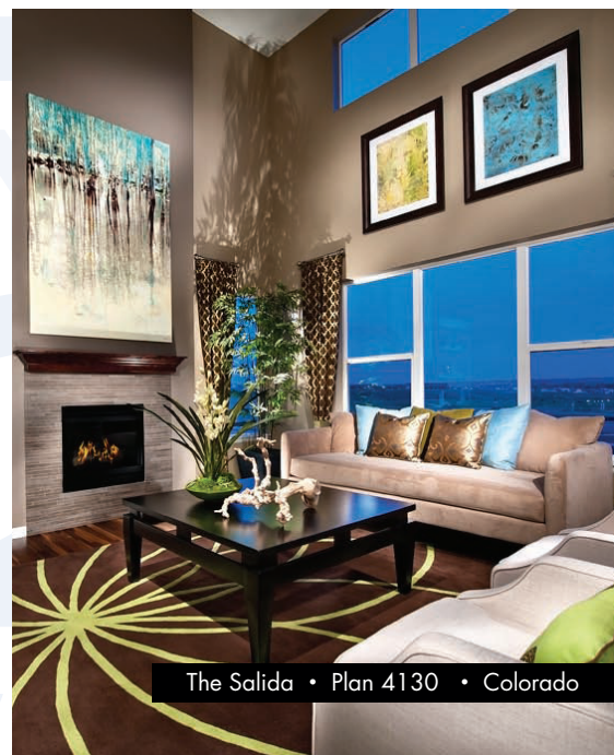
The Salida • Plan 4130 • Colorado

We include dozens of energy-efficient features in every home we build, meaning that Meritage homes are cleaner, quieter, healthier and more comfortable than most new or used homes.