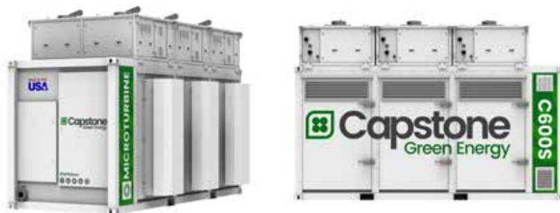
C600S ICHP Power Package

The Signature Series Microturbine provides ultra-low emissions and reliable electrical/thermal generation from LPG.