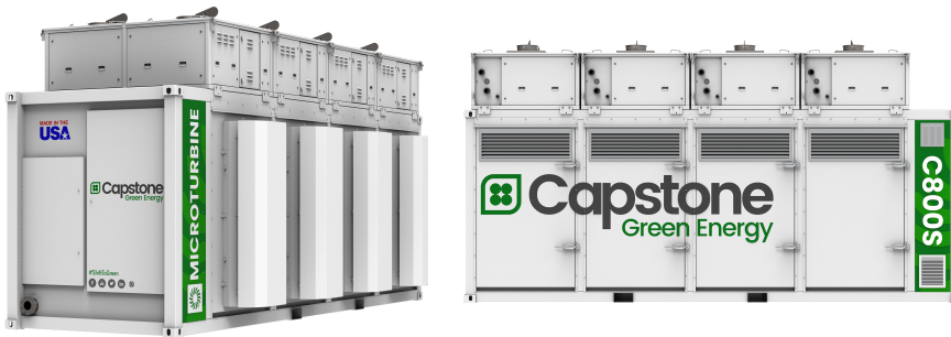
C800S ICHP Power Package

The Signature Series Microturbine provides ultra-low emissions and reliable electrical/thermal generation from natural gas.