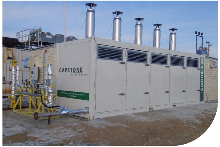
One C1000 Capstone microturbine provides a reliable power supply to the remote oil and gas customer.

The system is built in a modular container specifically designed to withstand severe climatic conditions, including operating temperatures ranging from -40°F to 122°F (-40°C to 50°C). The enclosure also provides a barrier against the increased dust content in the installation area.