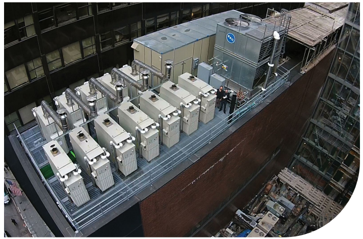
The Capstone C65 ICHP system ensures high reliability while also benefiting the environment.

depending on the season. During the cooling season (warmer months), the microturbines utilize the ICHP system to supply hot water to an absorption chiller for CCHP, offsetting approximately 200 tons from their existing electric chillers. During the heating season (colder months), the microturbines utilize the ICHP system to supply hot water to the “building side” of their city steam-to-hot-water heat exchangers, thus displacing city steam.