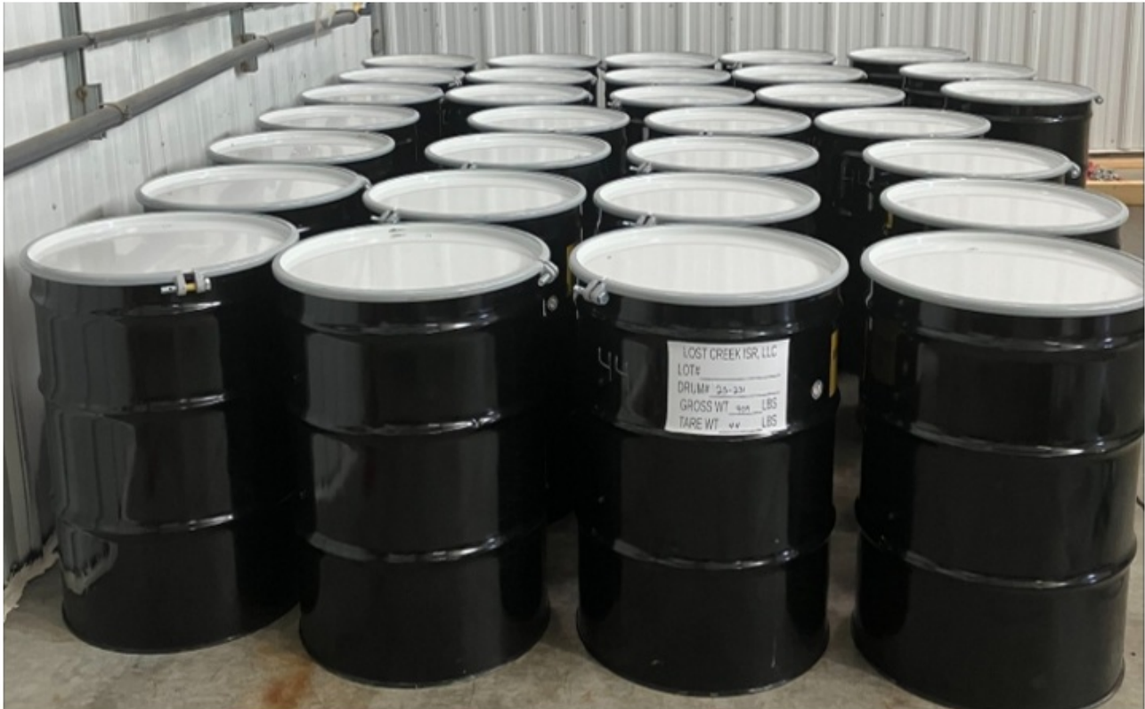
Photo 1: Lost Creek drums of powdered uranium concentrate "yellowcake"

planned upgrade of the filter press augers, allowing both dryers to be operational, upgrading reverse osmosis systems with new membranes for better wastewater treatment, inspecting and maintaining ion exchange columns and filters, and upgrading the plant control systems.