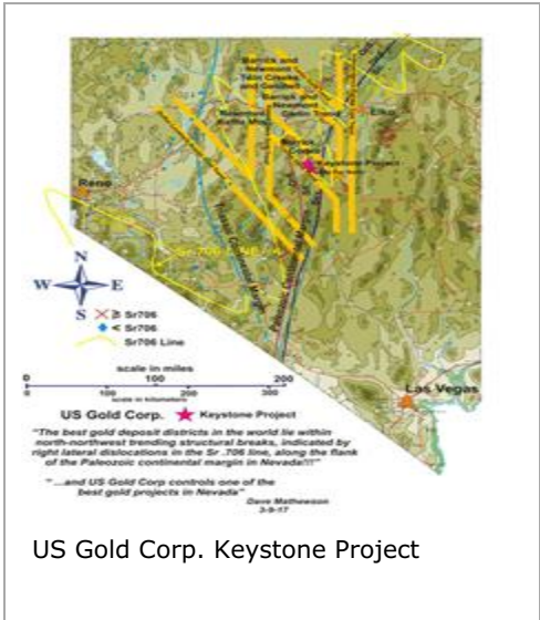
US Gold Corp. Keystone Project