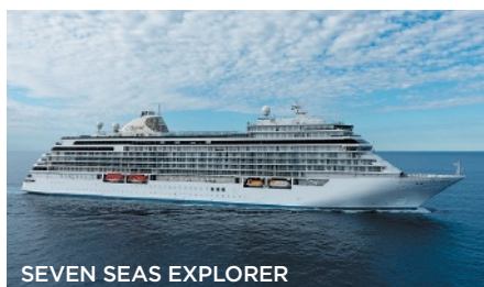
SEVEN SEAS EXPLORER