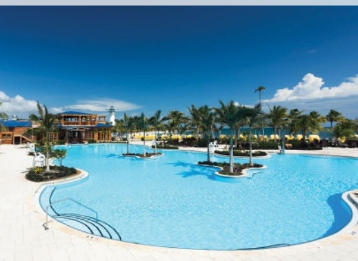
HARVEST CAYE'S 15,000 SQ. FT. POOL