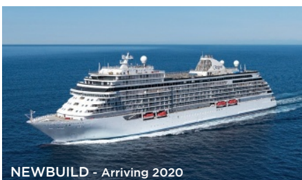
NEWBUILD - Arriving 2020