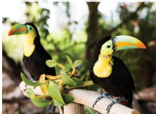
TOUCANS IN THE BIRD AVIARY