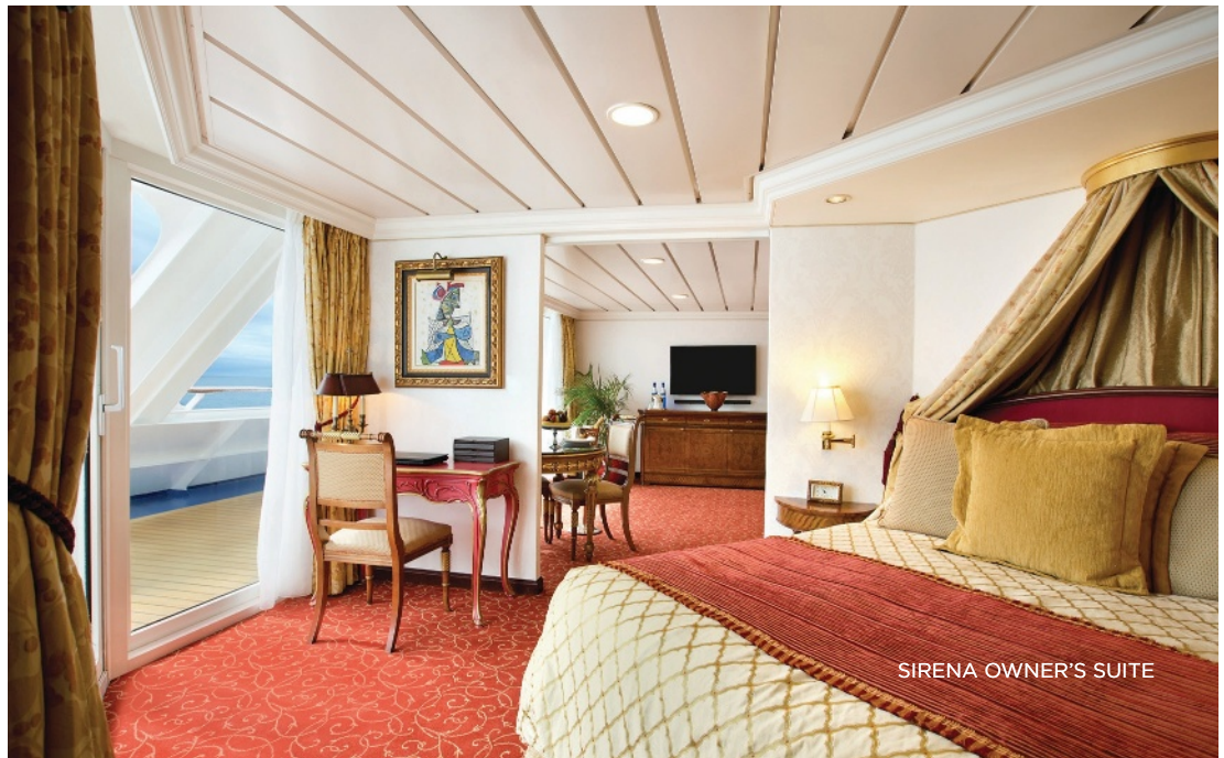
SIRENA OWNER'S SUITE