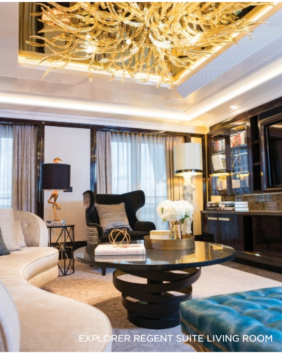
EXPLORER REGENT SUITE LIVING ROOM