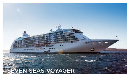
SEVEN SEAS VOYAGER