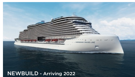
NEWBUILD - Arriving 2022