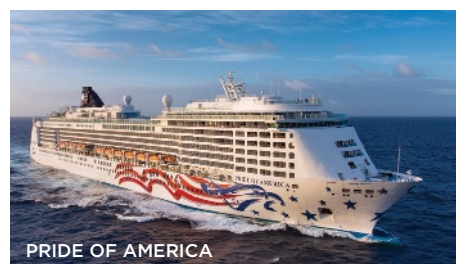
PRIDE OF AMERICA