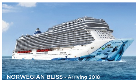
NORWEGIAN BLISS - Arriving 2018