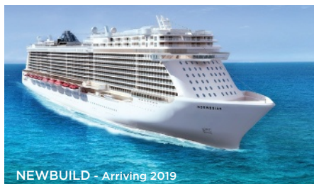
NEWBUILD - Arriving 2019