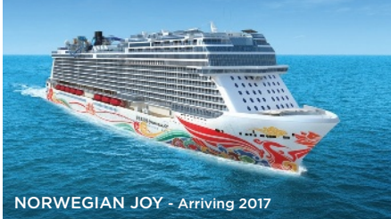
NORWEGIAN JOY - Arriving 2017