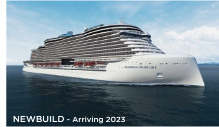
NEWBUILD - Arriving 2023