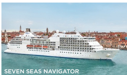
SEVEN SEAS NAVIGATOR