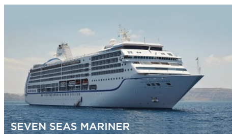
SEVEN SEAS MARINER