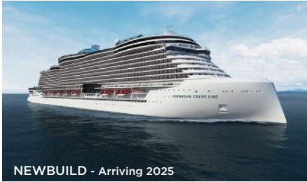
NEWBUILD - Arriving 2025