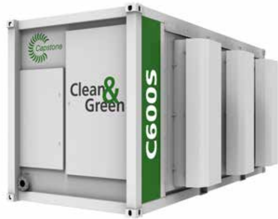
The C600S Microturbine provides up to 600kW of electric power and contains three air bearing microturbines.