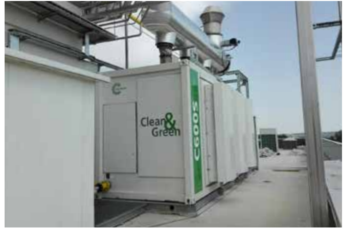
The Capstone C600S Microturbine system utilizes reliable natural gas for Furlotti's processing plant.

The system will require only ordinary maintenance every 8,000 hours and an overhaul every 40,000 hours.