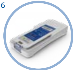
Inogen One ® G4 Lithium Ion Battery* Up to 3 hours run time Item #BA-400