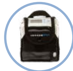
Inogen One ® G4 Carry Bag* Item # CA-400