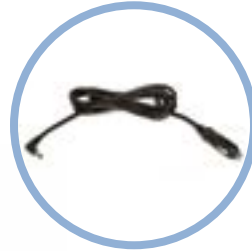
Inogen One ® G4 DC Power Cable* Item # BA-306