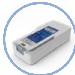
Inogen One ® G4 Extended Life Lithium Ion Battery** Up to 5 hours run time Item #BA-408