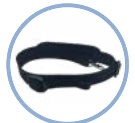
Inogen One ® G4 Carry Strap* Item # CA-401