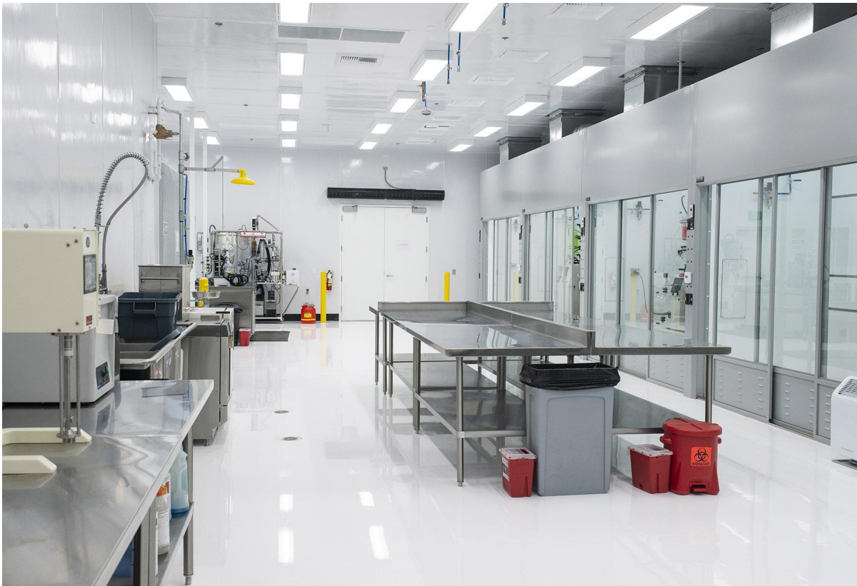
Photo: City Trees production facility, Las Vegas, NV