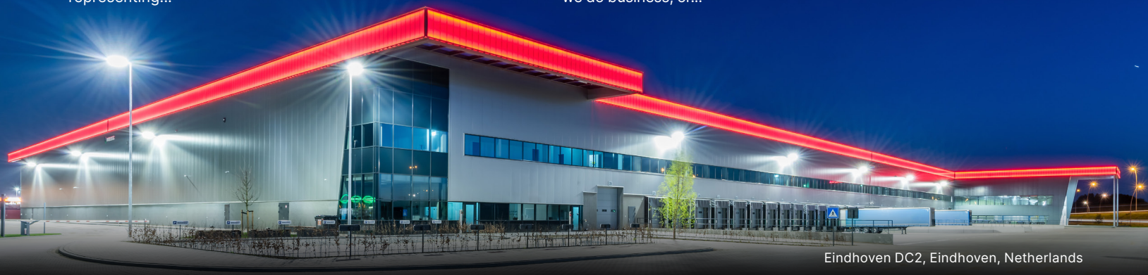
Eindhoven DC2, Eindhoven, Netherlands