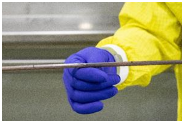
Close-up View of the Enriched Uranium-Zirconium Rod Post-Extrusion, still covered in the extrusion lubricant