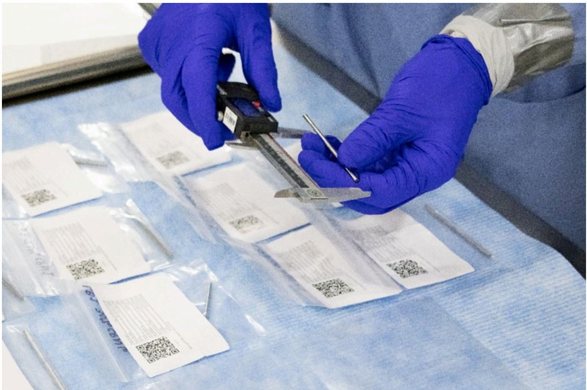
Image 10: Taking dimensional measurements of a finished enriched uranium-zirconium coupon sample