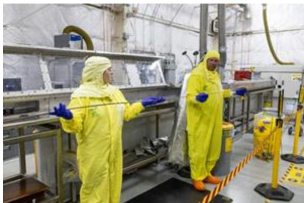
Enriched Uranium-Zirconium Rod Post-Extrusion