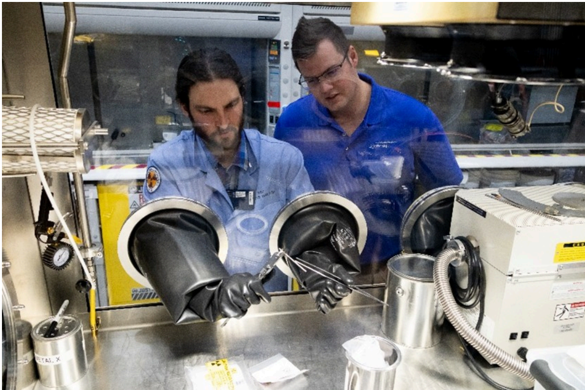
Image 5: Lightbridge and INL team performing a visual inspection of a finished enriched uranium-zirconium coupon sample inside a glovebox