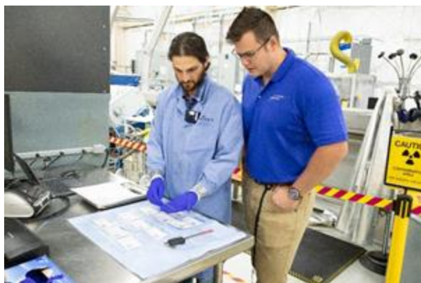
INL and Lightbridge team inspecting the finished enriched uranium-zirconium coupon samples