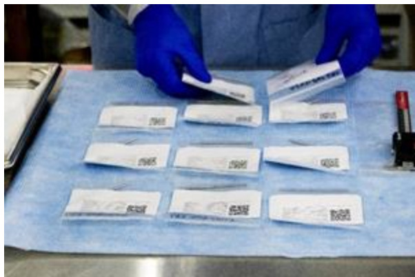
Finished enriched uranium-zirconium coupon samples after characterization and visual inspection results confirmed their suitability for irradiation testing in the Advanced Test Reactor