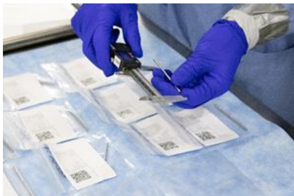
Taking dimensional measurements of a finished enriched uranium-zirconium coupon sample