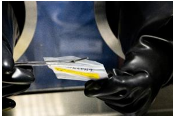
A close-up view of a finished enriched uranium-zirconium coupon sample