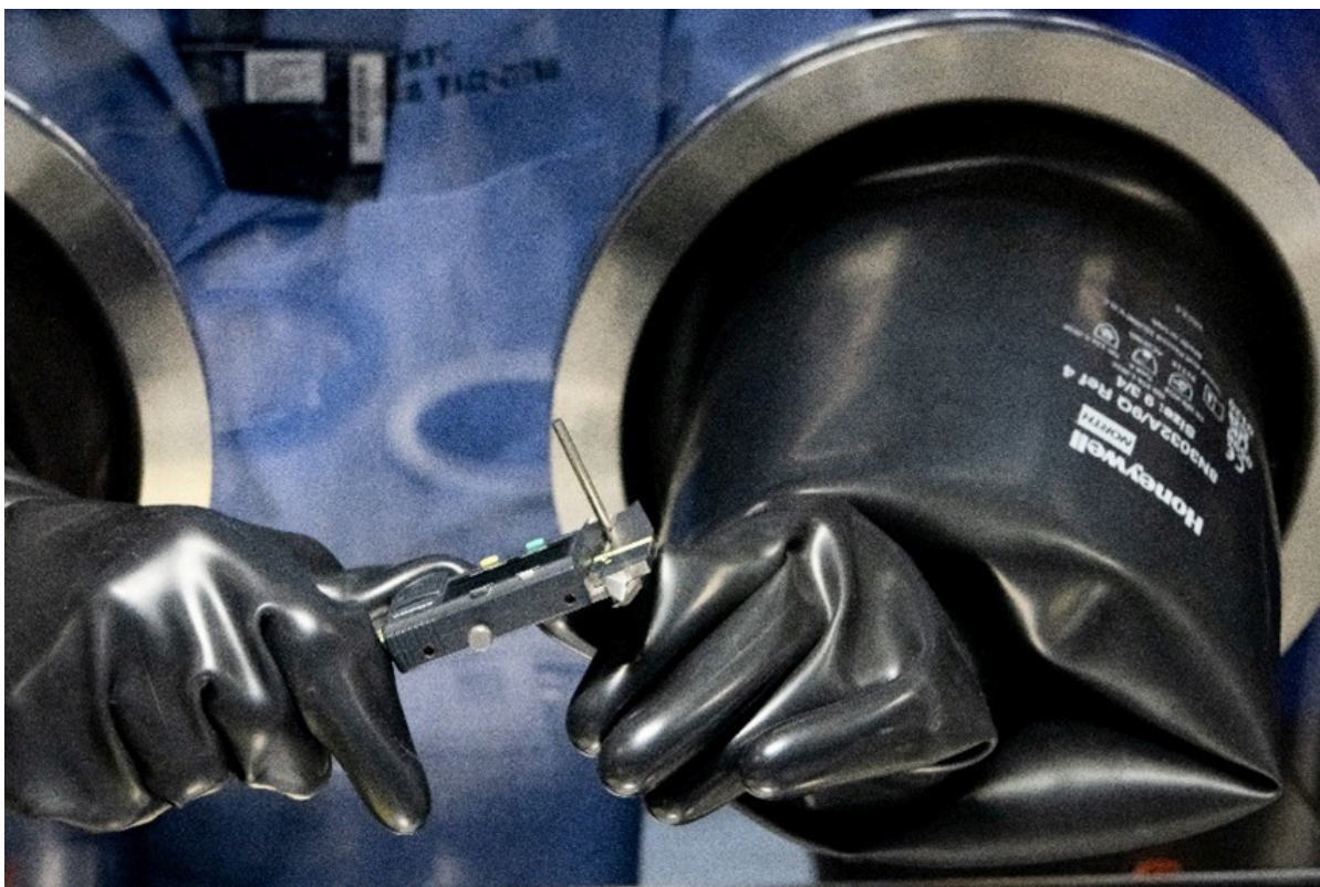
Image 7: Taking dimensional measurements of a finished enriched uranium-zirconium coupon sample