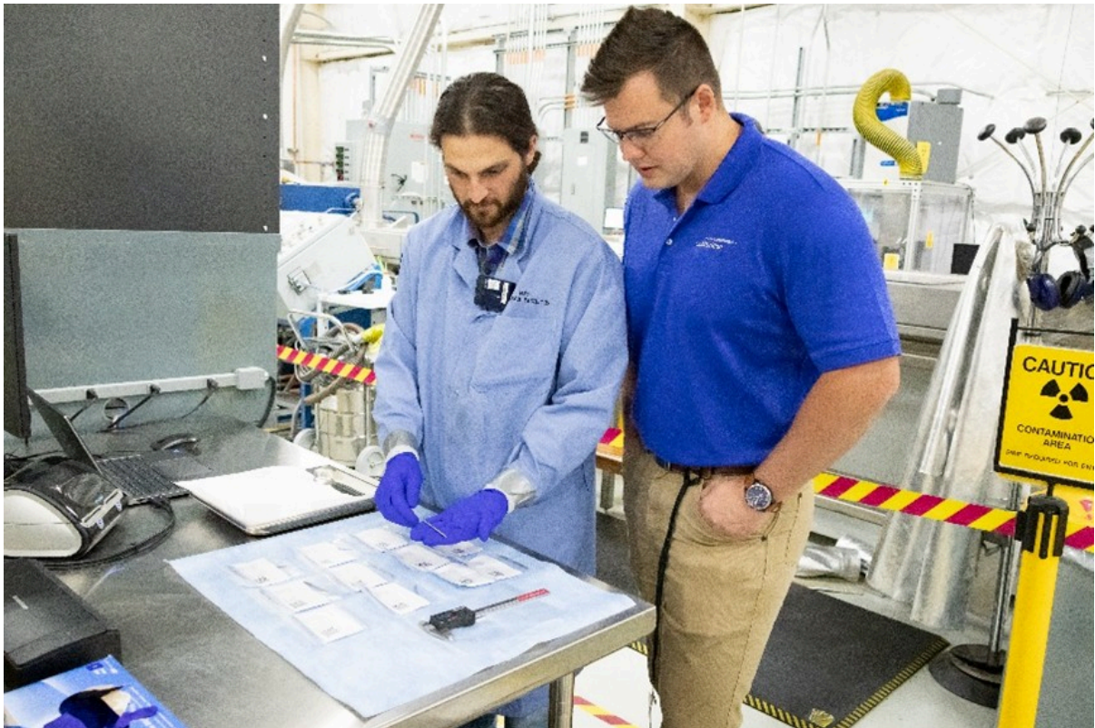
Image 9: INL and Lightbridge team inspecting the finished enriched uranium-zirconium coupon samples