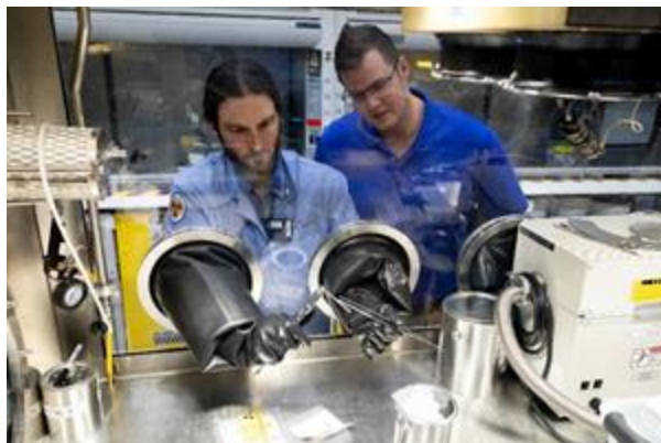
Lightbridge and INL team performing a visual inspection of a finished enriched uranium-zirconium coupon sample inside a glovebox