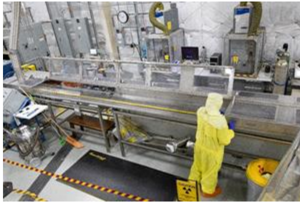
View of the Working Space from Above