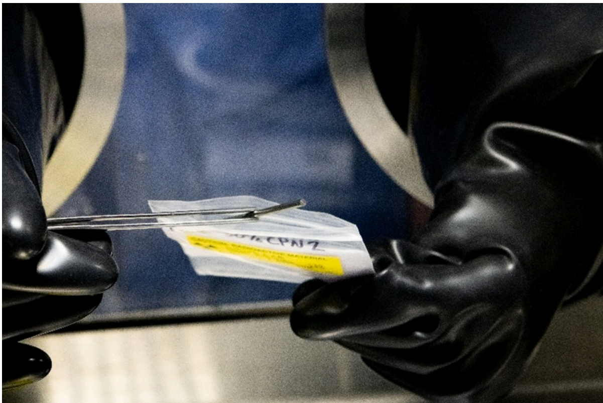
Image 6: A close-up view of a finished enriched uranium-zirconium coupon sample