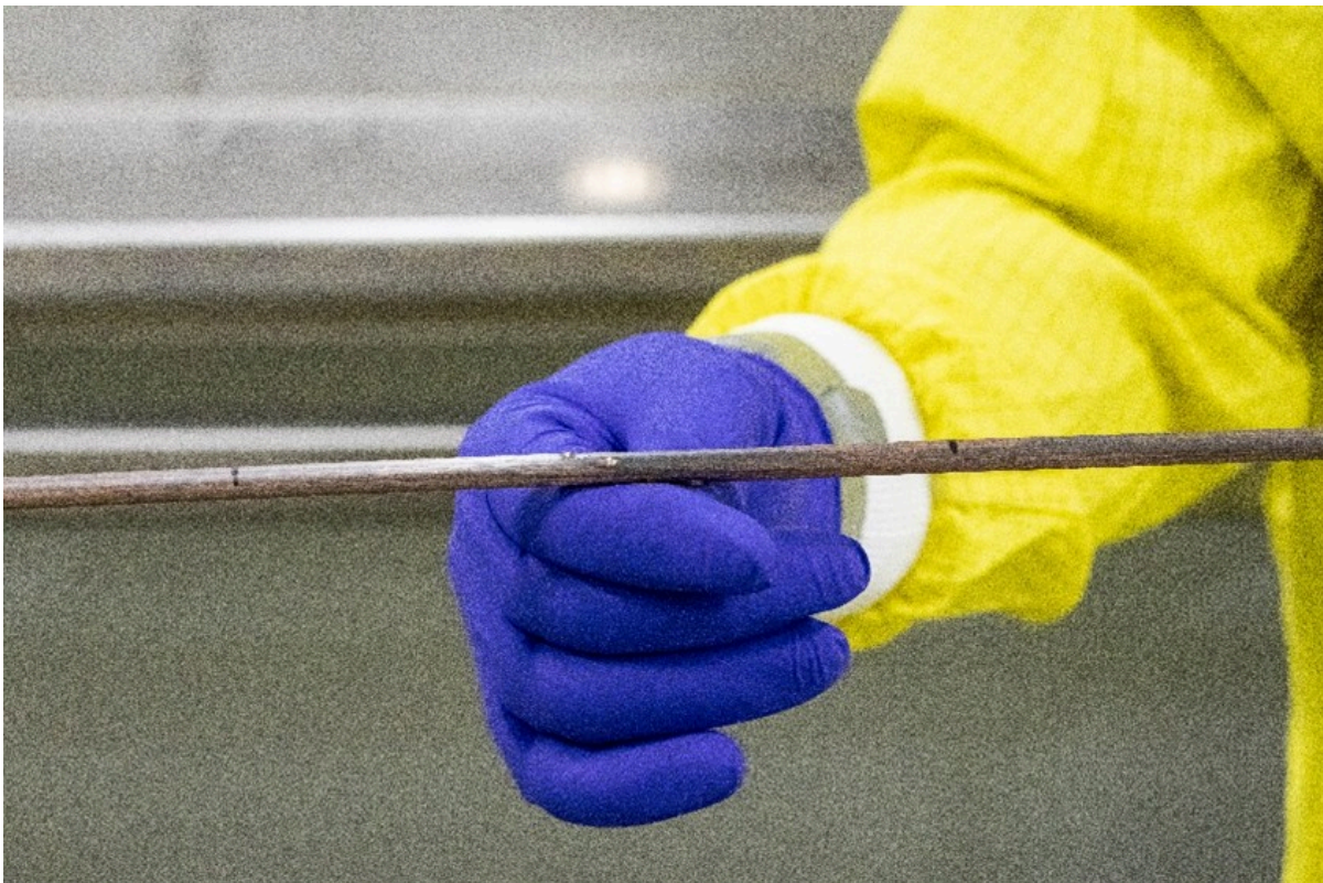
Image 2: Close-up View of the Enriched Uranium-Zirconium Rod Post-Extrusion, still covered in the extrusion lubricant