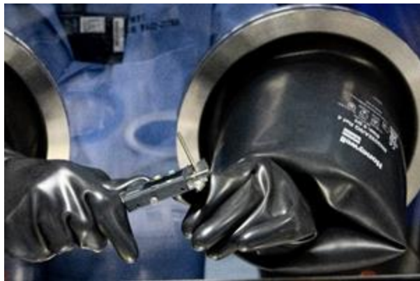
Taking dimensional measurements of a finished enriched uranium-zirconium coupon sample