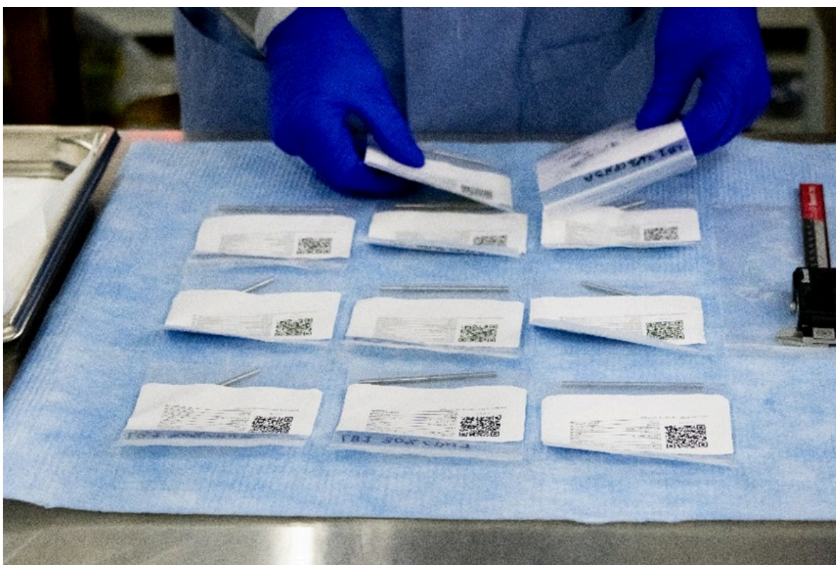
Image 8: Finished enriched uranium-zirconium coupon samples after characterization and visual inspection results confirmed their suitability for irradiation testing in the Advanced Test Reactor