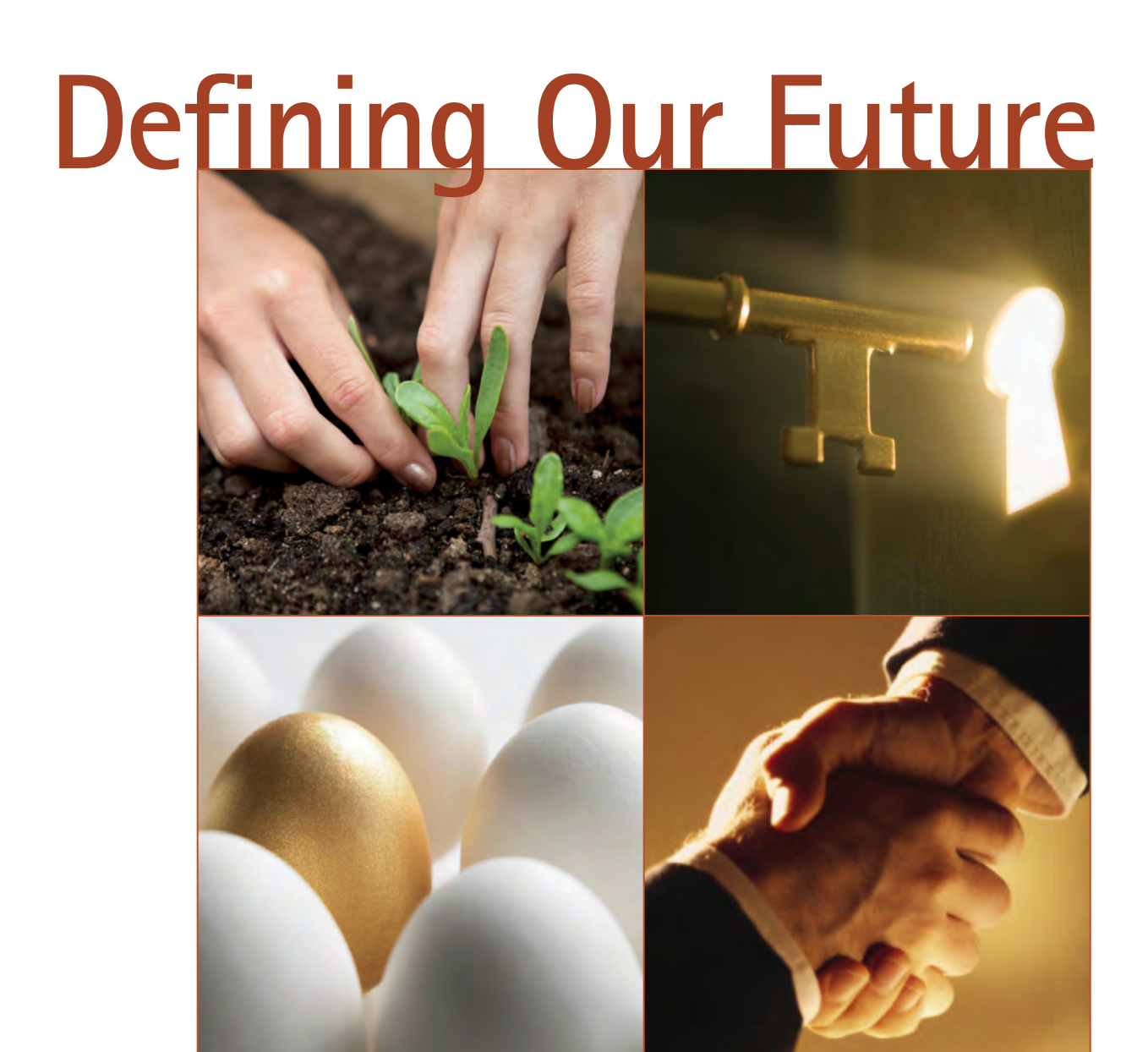
Hanmi Financial 2012 ANNUAL REPORT