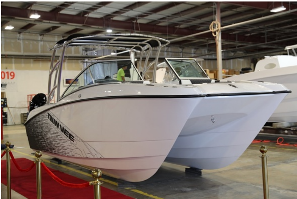
The 240 DC on display on the Twin Vee factory floor

"We originally referred to the 240 DC as the Italia . We chose that name as a tribute to the Alpine lake region of northern Italy famous for the impeccable design and craftsmanship of Ferrari, Alfa Romeo, Maserati, Lamborghini, the Pininfarina design house and those beautiful Riva speedboats of the 1950s. We intentionally set the bar high to build an 'American Dream Boat' that pays homage to this great design heritage, but also offers pure fun on the water at a great price," remarks Visconti.