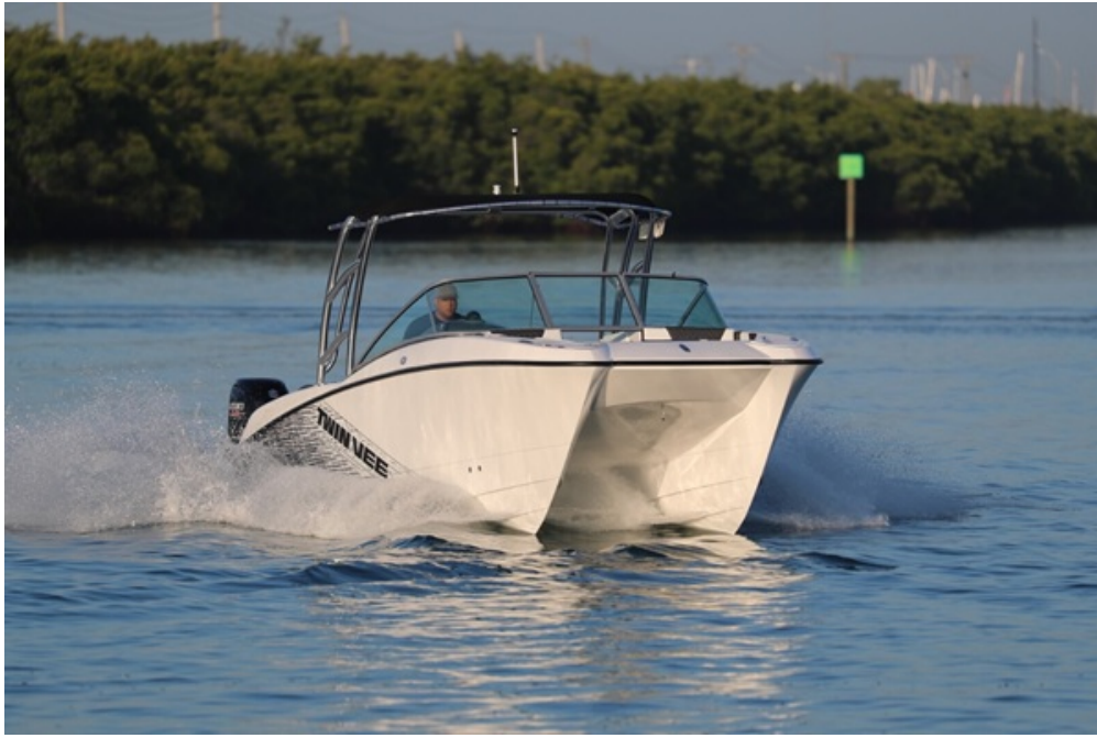
The 240 DC on the water

"We originally referred to the 240 DC as the Italia . We chose that name as a tribute to the Alpine lake region of northern Italy famous for the impeccable design and craftsmanship of Ferrari, Alfa Romeo, Maserati, Lamborghini, the Pininfarina design house and those beautiful Riva speedboats of the 1950s. We intentionally set the bar high to build an 'American Dream Boat' that pays homage to this great design heritage, but also offers pure fun on the water at a great price," remarks Visconti.