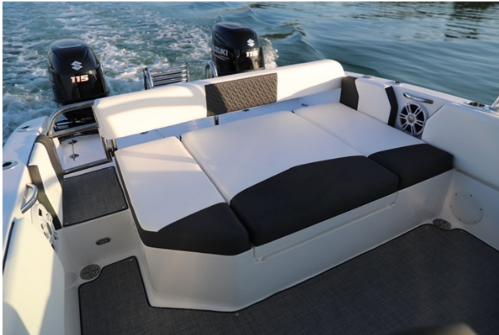
A closer look at the aft of the 240 DC

crossover watercraft that the entire family can enjoy has not wavered. " We are excited for experienced boaters and new boaters alike to see and ride in the 240 DC Powercat for themselves. This is the boat that will raise your heart beat a few levels upon initial glance. And when you board the boat for the first time - we're confident you'll be able to quickly notice the refinement, quality, and modern design that went into the manufacturing of this one-of-kind boat. You won't be able to help but envision yourself igniting those twin engines and heading out to sea for a Great Adventure."