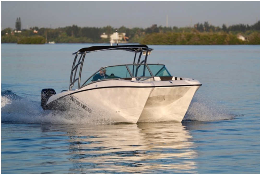
The exterior of the all-new 240 Dual Console