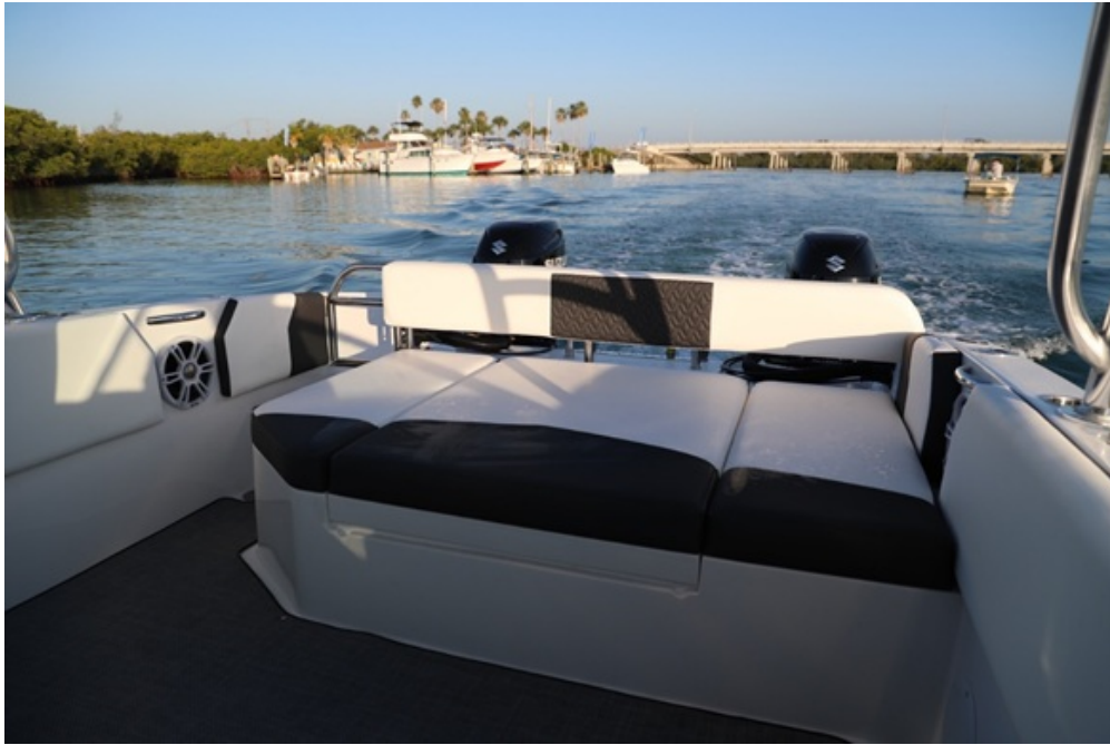
The 240 Dual Console's aft daybed

precision-guided seatbacks and bolsters into beautifully upholstered platforms and an aft daybed. Moreover, Yarborough adds that "Twin Vee's meticulously designed molded non-skid surfaces will also offer safe and easy entry, including from an open aft platform with portside entry."