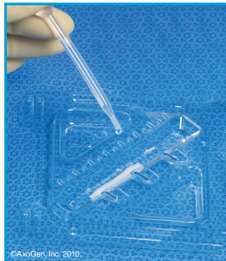
Figure 4: Preparation of Avance®. Avance® was thawed in room temperature saline for 5-10 minutes.