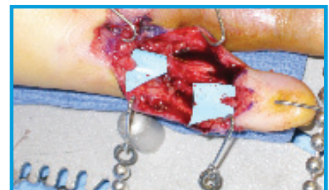
Figure 2: Exposure of Nerve Stumps. The nerve was exposed and then trimmed until healthy tissue could be visualized.