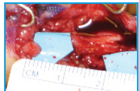
Figure 3: Measurement of Defect. The length of the gap and nerve diameter were measured in order to choose the most appropriate Avance® size. In this case, a 2-3mm diameter and 30mm length was selected.