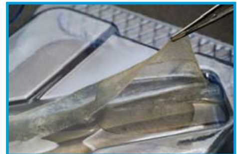
Figure 2. Hydration of AxoGuard® in pre-molded hydration reservoir prior to implantation.