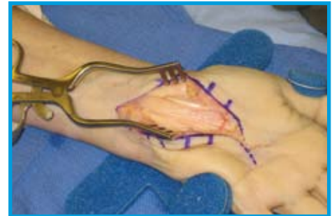
Figure 1. Nerve release and exposure. Scar tissue surrounding the nerve was dissected, starting proximally with undamaged tissue. Internal neurolysis was performed at the juncture of nerve branches on the distal side to release scarring between fascicles