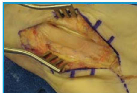
Figure 5. Completed implantation of AxoGuard® Nerve Protector.