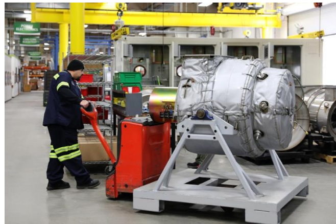
Lean Manufacturing and 5S: Core Elements of Capstone's Operational Model