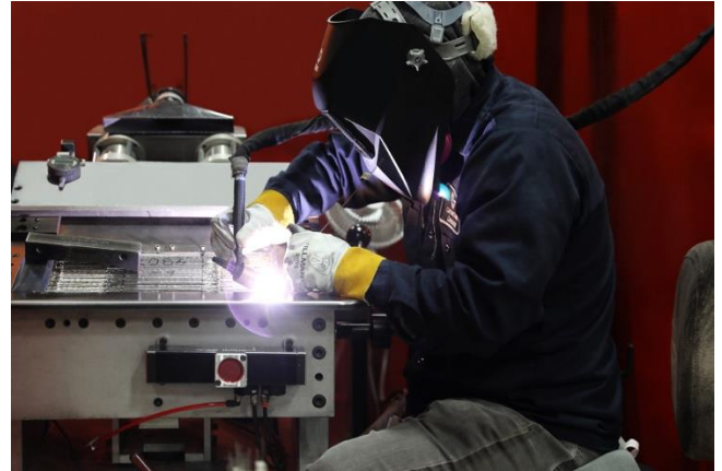
Precision and Repeatability Help to Ensure Quality at Capstone

reducing operating expenses. We also managed to do all of these things while keeping our team safe and promoting the family culture we've always strived for. The future goals are much of the same, continuing to address issues that cost the business money, all while keeping the team safe and motivated.