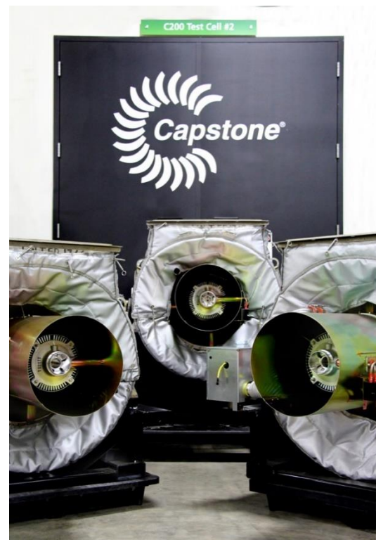
C200 Engines Ready for Installation

Suppliers that we'd been with for over 20 years suddenly wouldn't return our calls or emails, and when they did, they were raising prices as much as 5x. We wouldn't be sitting here right now having this conversation if our organization didn't respond the way it did. While many went onshore, we had to look offshore. We were able to make great new partners that met our cost, delivery and quality requirements even in this challenging environment. As a bonus, many of them agreed to help share the costs of the tariffs. A lot of the aforementioned cost reductions came out of these efforts. Now, those old suppliers are calling us back and asking about new business, but that's probably a conversation for our next chat.