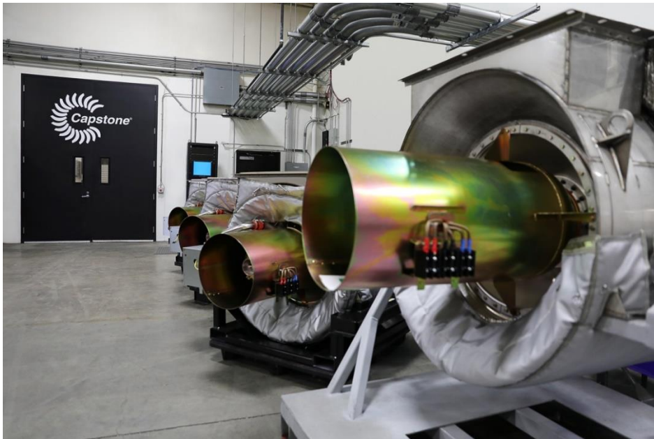
Capstone C200 Engine

This report focuses on Capstone Turbine Corporation (NASDAQ: CPST) and its goal of becoming a zero-waste facility, its changing operation model, cost-cutting and material challenges with tariffs.