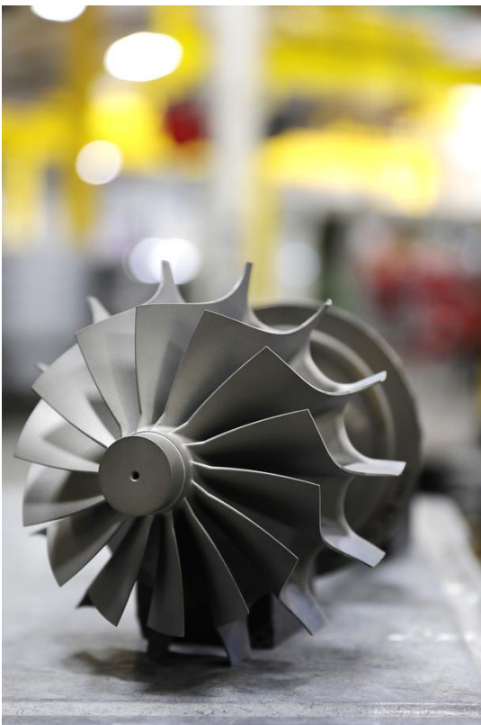
Capstone Turbine's C65 Rotor Group

That said, we're a very lean shop. Labor only makes up less than 25% of the total cost of our products, the rest being purchased materials. There are only about 40 people involved in the actual "build" of the product. All the work cells are set up in modules, and we focus heavily on efficiency, safety, quality and cross-training. This allows maximum flexibility in shifting labor needs.