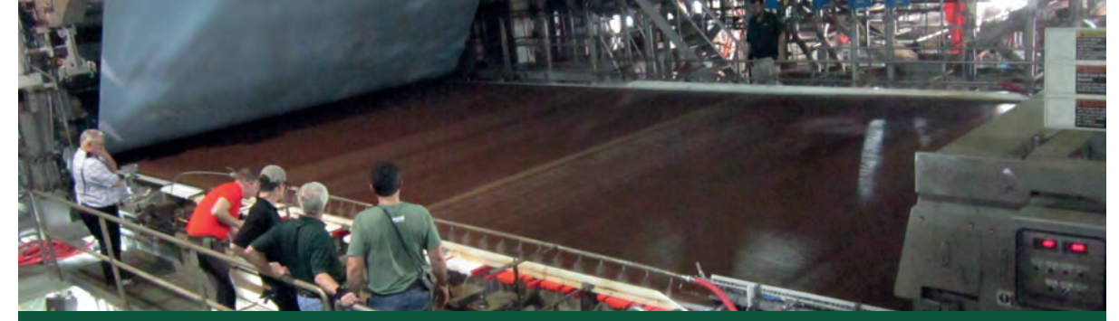
Headbox and Press Section: We invested $40 million to upgrade two headboxes on our #6 SUS<sup>™</sup> paper machine in West Monroe, Louisiana. The project has lowered variable costs at the mill and resulted in improved sheet quality, which is driving lower costs in our downstream converting facilities.