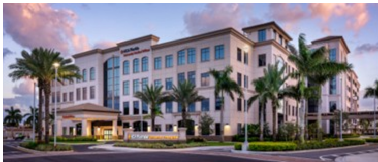
HCA Florida University Medical Office Building - Davie, Florida.

Click here for a 3D tour of the very first NovaScan Neuroimaging Clinics™ location in the U.S., to be opened in a newly built suite, which is currently being furnished and fully outfitted: Offices 360 View