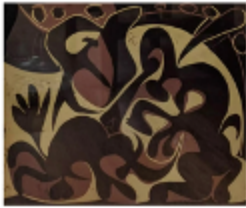
ARTIST: Picasso TITLE: Fruitero pánico al toro, con matador al quite DATE: 1959 - 1961 MEDIUM: Lithout SIZE: 10 x 15 7/10 SIDEMARK: ART-DK15-F24-PR7-03 C LOCATION: Art at Prime 07 free-standing wall