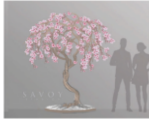
ARTIST: Savoy Studios TITLE: Bonsai Cherry Tree Sculpture DATE: 2023 MEDIUM: Bronze and handblown glass SIZE: 2338 x 1960 SIDEMARK: ART-DK5-F24-PAC-001 LOCATION: Sculpture at Pacific Rim entry vestibule Concept rendering