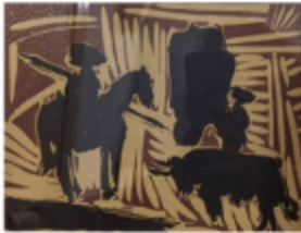
ARTIST: Picasso TITLE: Antes de salir al toro DATE: 1959 - 1961 MEDIUM: Lithout SIZE: 7 9/10 x 10 1/8 in SIDEMARK: ART-DK10-F24-PR7-03 B LOCATION: Art at Prime 07 free standing wall