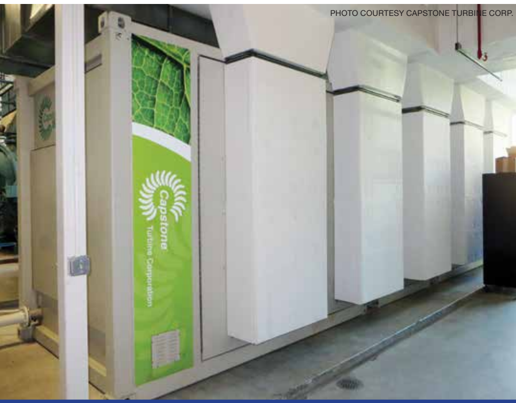
Capstone Turbine Corp. manufactures microturbines that typically pay for themselves within three to five years, according to Jim Crouse, executive vice president of sales and marketing.

The systems' electrical efficiencies increase as the size of the microturbine increases. Multiple units can be connected