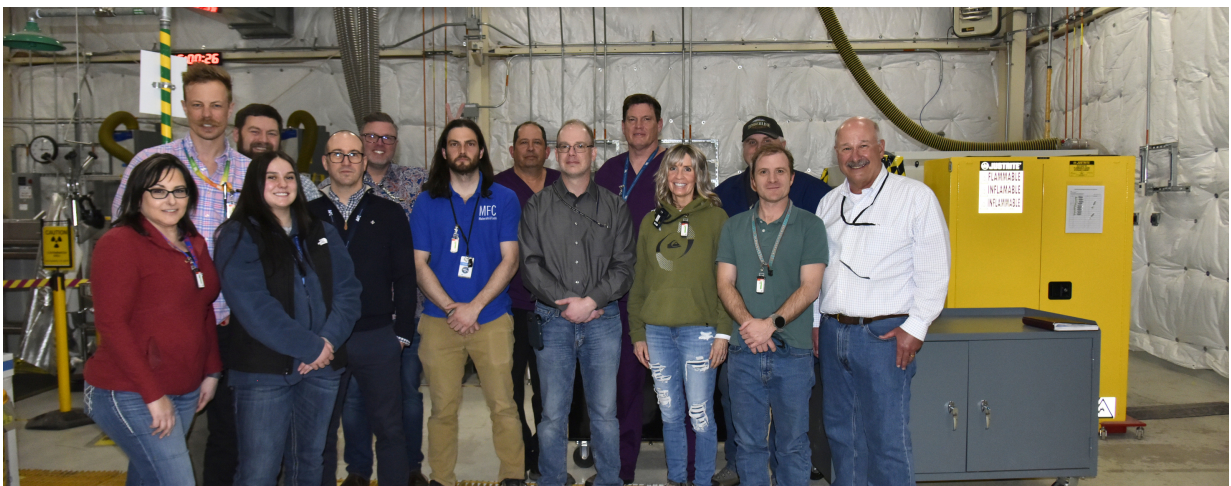
INL and Lightbridge Teams at the Experimental Fuel Facility at INL