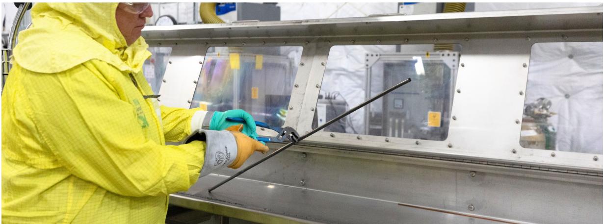
Uranium-Zirconium Rod Post-Extrusion