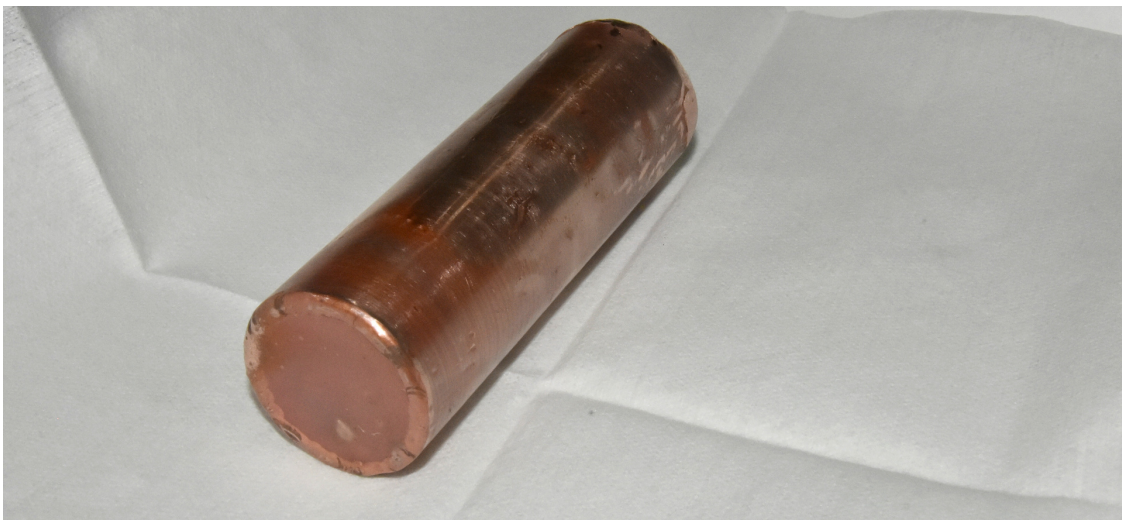
Uranium-Zirconium Alloy Billet Encased in Copper Sheath

https://www.ltbridge.com/news-media/media-gallery/video/video/7194/lightbridge-demonstration-of-the-extrusion-process-for