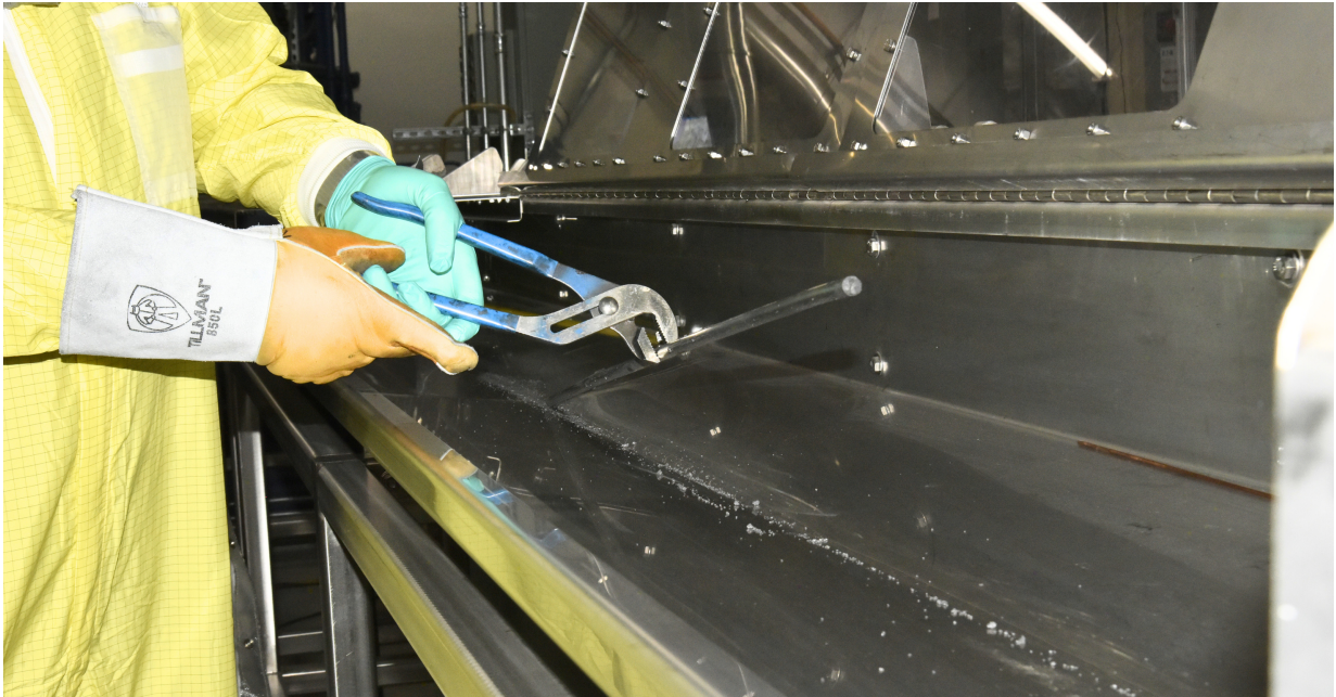
Uranium-Zirconium Rod Post-Extrusion