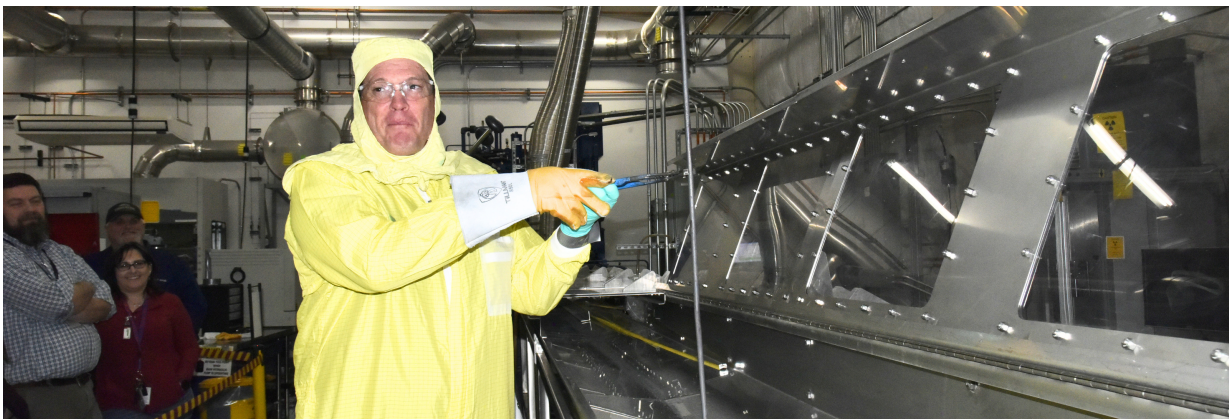
Uranium-Zirconium Rod Post-Extrusion