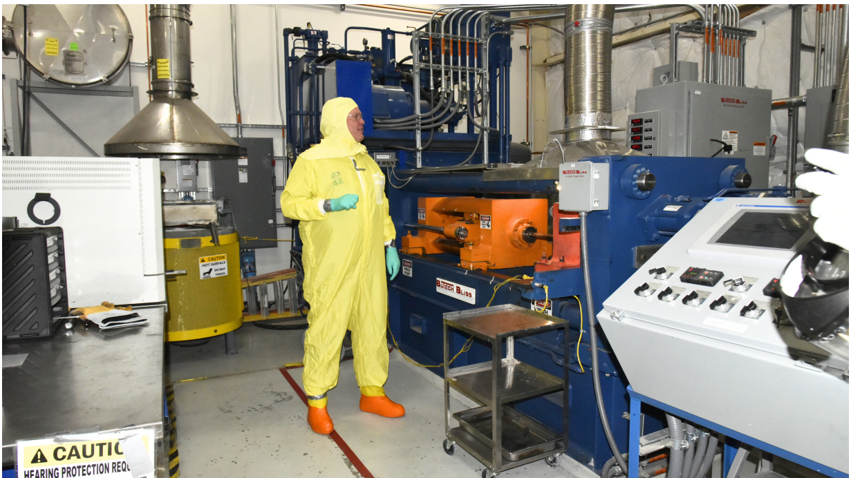
Extrusion Press at Idaho National Laboratory