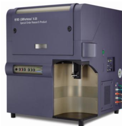
BD LSRFortessa™ X-20