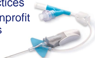
BD Nexiva™ Closed IV Catheter System