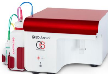
BD Accuri™ Analyzer