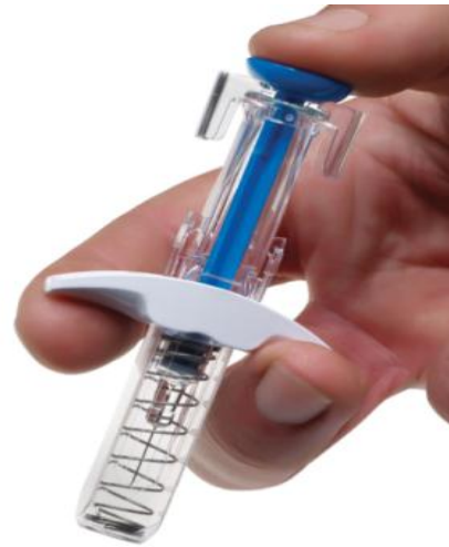
BD UltraSafe PLUS™ (SSI)