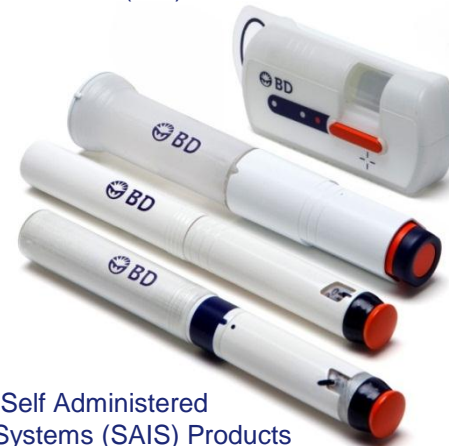
BD Self Administered Injectable Systems (SAIS) Products