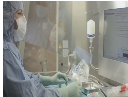
BD Cato™ Software

Enabling safer, simpler, and more effective parenteral drug delivery, focused on medication assurance