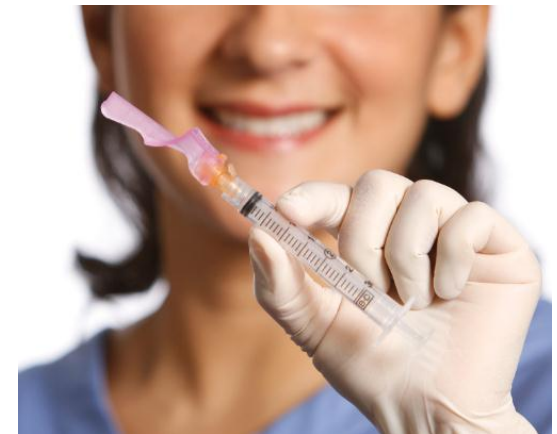
BD Eclipse™ Needle and Syringe