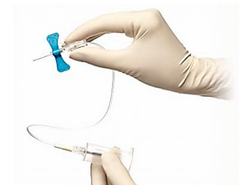
BD Vacutainer™ Push Button Blood Collection Set