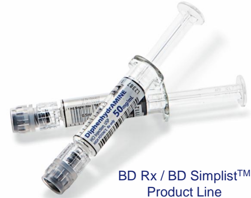
BD Rx / BD Simplist™ Product Line