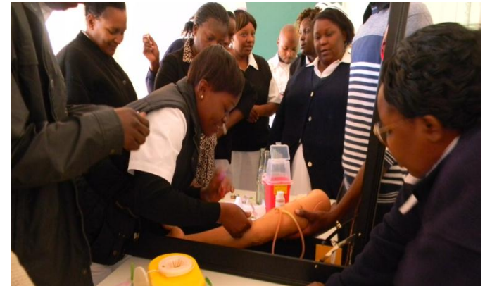
BD laboratory strengthening programs in emerging markets