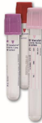
BD Vacutainer™ Blood Collection Tubes