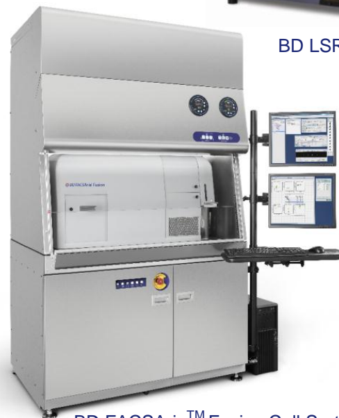
BD FACSria™ Fusion Cell Sorter