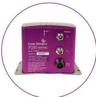
GNSS Processing Unit