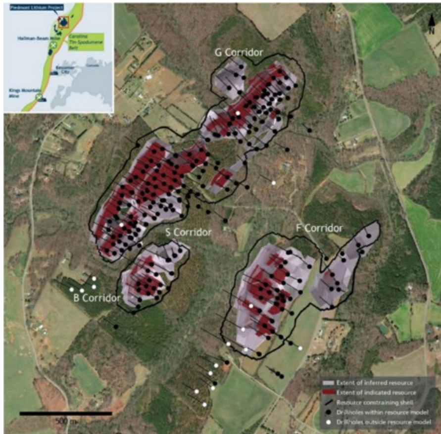
Extent of Lithium Mineralization Identified to date at the Project