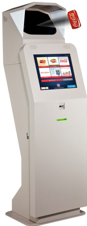
Figure 1. Provision's 3D Savings Center Kiosk has been deployed at 400 Rite Aid locations in Los Angeles and New York.

Rite Aid, a major US retail chain with thousands of stores across the country, is deploying Provision's 3D Savings Center Kiosk to engage customers, increase traffic, and boost sales. Four hundred kiosks have been installed so far, and Provision will continue to aggressively expand stores in 2016. Provision is also pursuing agreements to launch 3D holographic displays and kiosks at other major chains in the US and around the world.