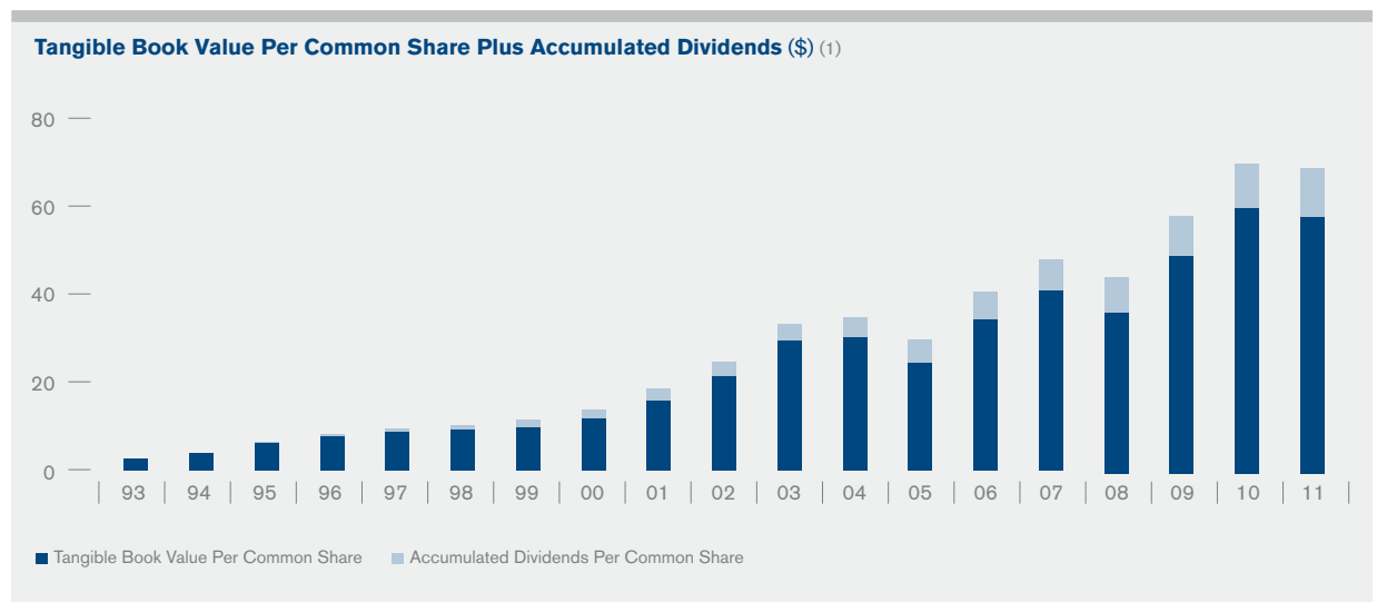
(1) In this Annual Report, we refer to various non-GAAP measures, which are explained in the Comments on Regulation G on pages 19 and 20.

"Our investment strategy is to provide stability and security first and foremost to support our underwriting activities."