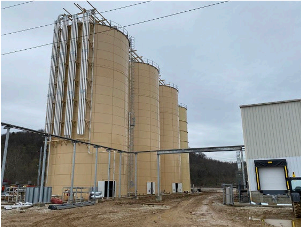
Figure 4: Installation of Rail Loadout Rail and Ties