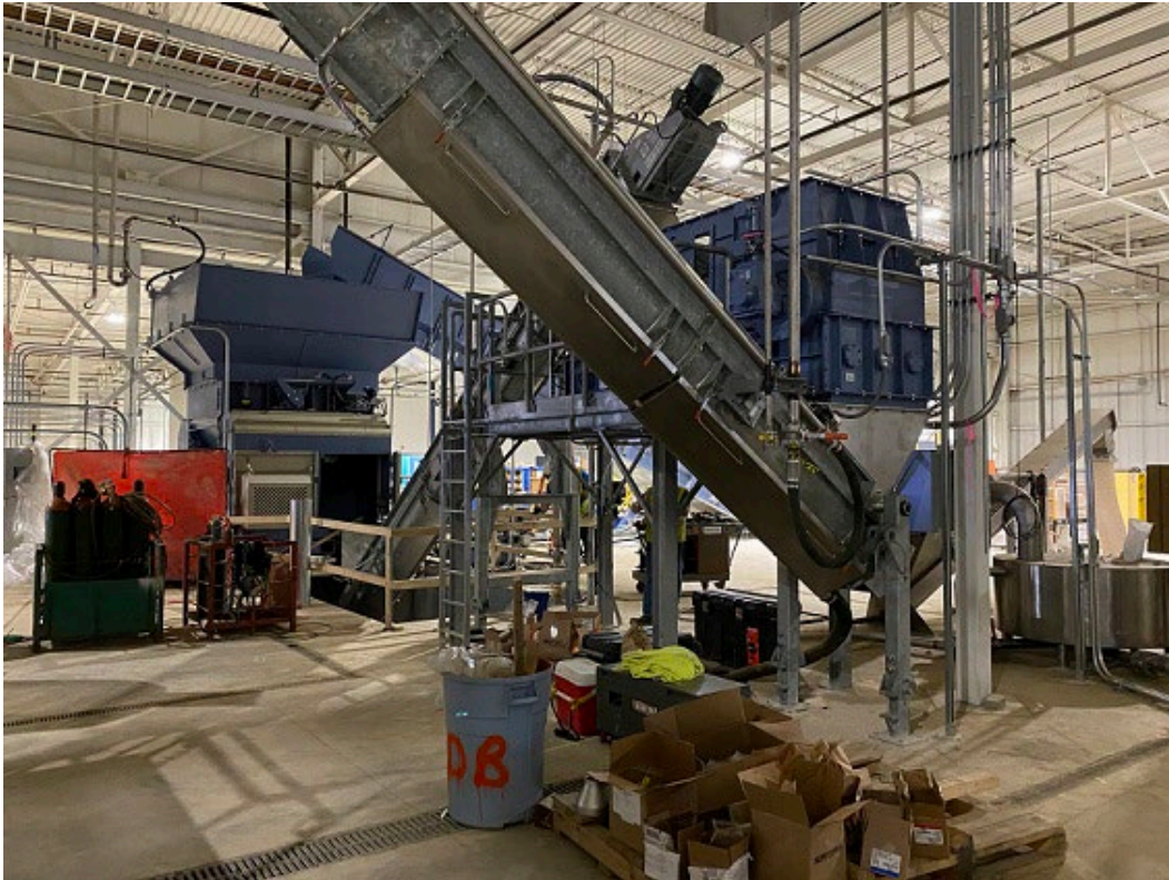
Figure 2: Installation of Pre-process Metal Removal Conveyor in Building 504