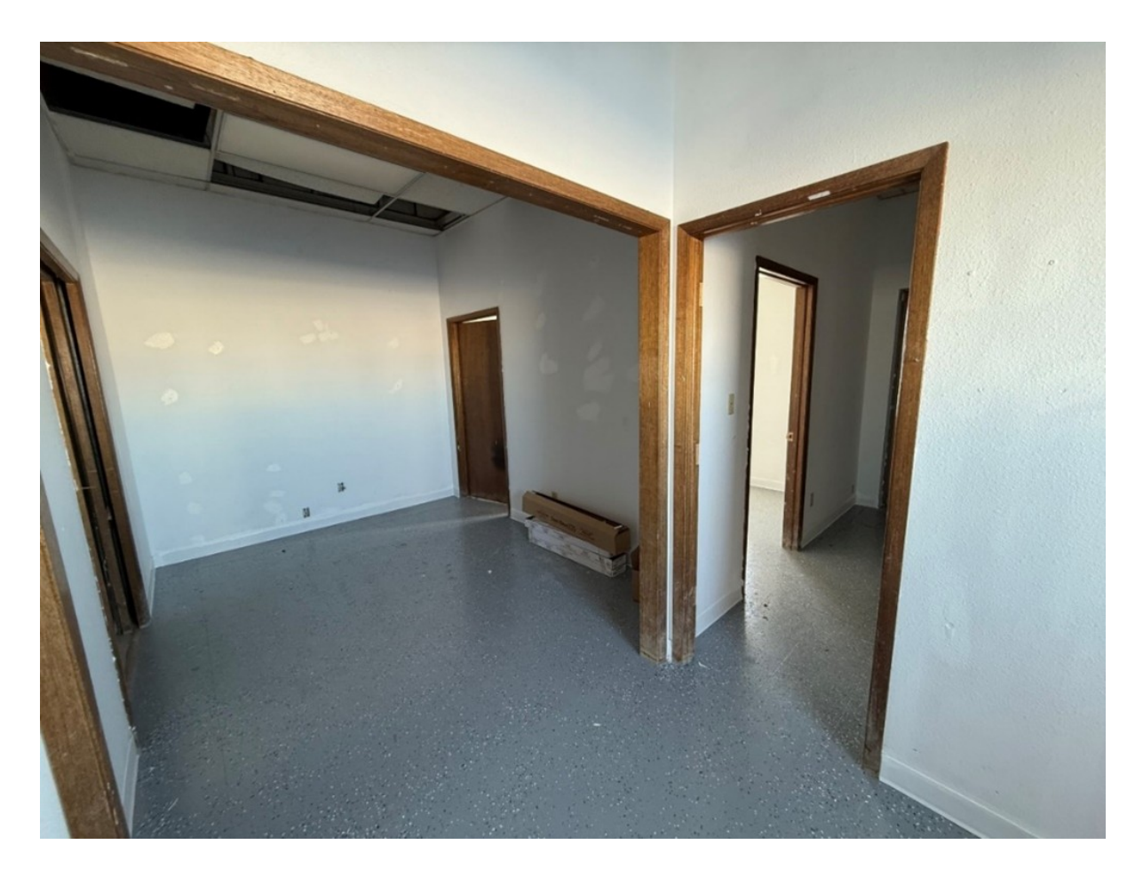
Interior of the conventional mine medical building that is being updated for office and warehouse space. Total square footage of 2,800.