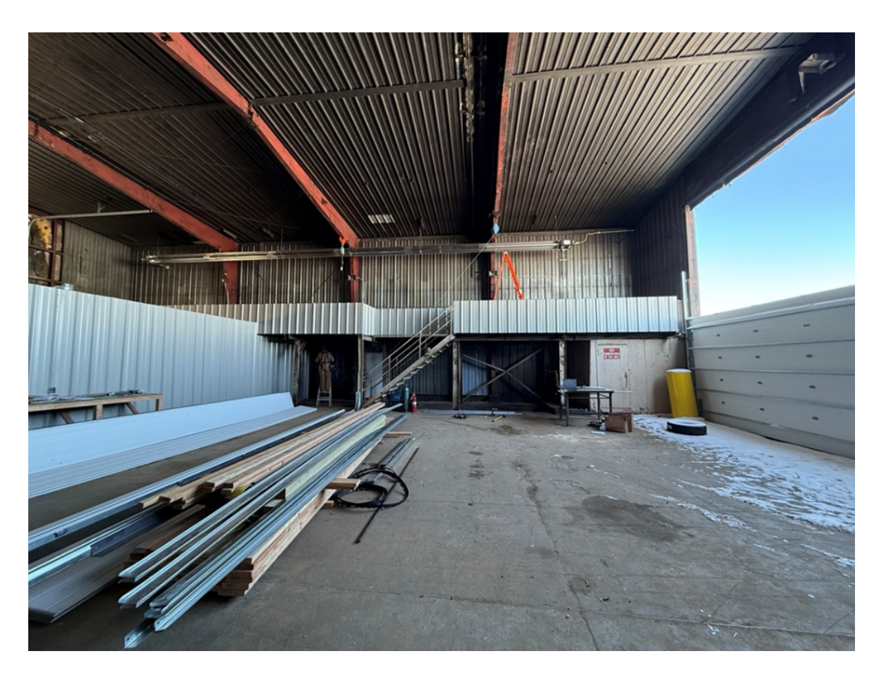
Interior of the conventional mine "wash bay" that is being updated for use as a drilling and logging building. Total square footage is 4,400.