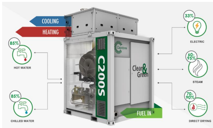
Capstone's C200S application.

Please click the link for the latest steam application case study - http://bit.ly/2rlcZE4