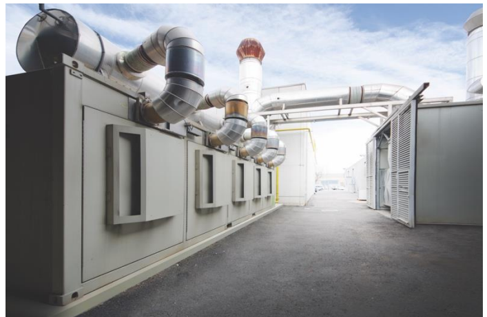
Felsineo La Mortadella.

For Capstone's latest case study about CHP, please click the link: http://bit.ly/2DKq4A6