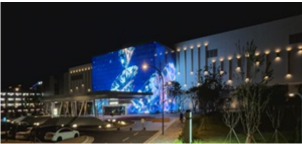
Mohegan INSPiRE Entertainment Resort