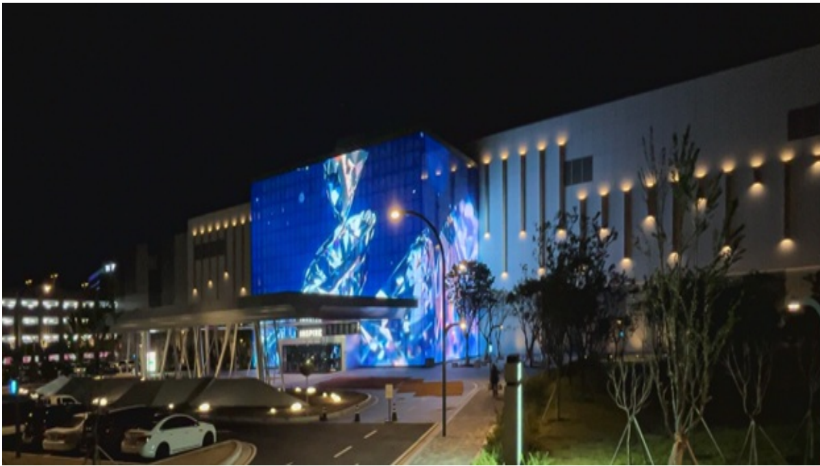
Mohegan INSPIRE Entertainment Resort

Captivision's transparent media glass façade represents a significant milestone in the convergence of art, architecture, and technology. As the first installation of its kind at a major hospitality venue in Korea, it sets a new standard for captivating visual experiences within urban landscapes.