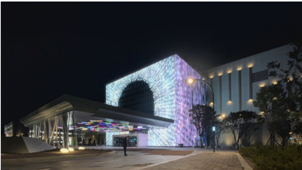
Mohegan INSPIRE Entertainment Resort

The transparent media glass façade at INSPIRE seamlessly integrates advanced display capabilities with the resort's striking architecture to take the location's already unique nature to the next level. Designed to captivate and engage viewers, the space allows for the vivid display of media content, creating a mesmerizing canvas and enriching the overall ambiance and guest experience.