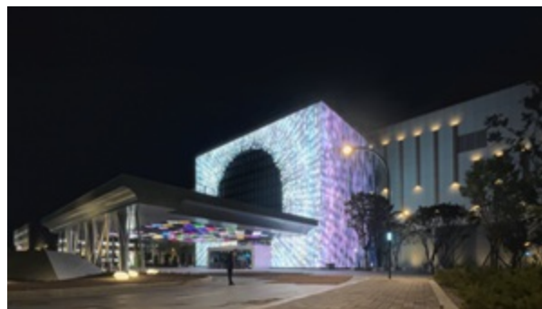
Mohegan INSPIRE Entertainment Resort