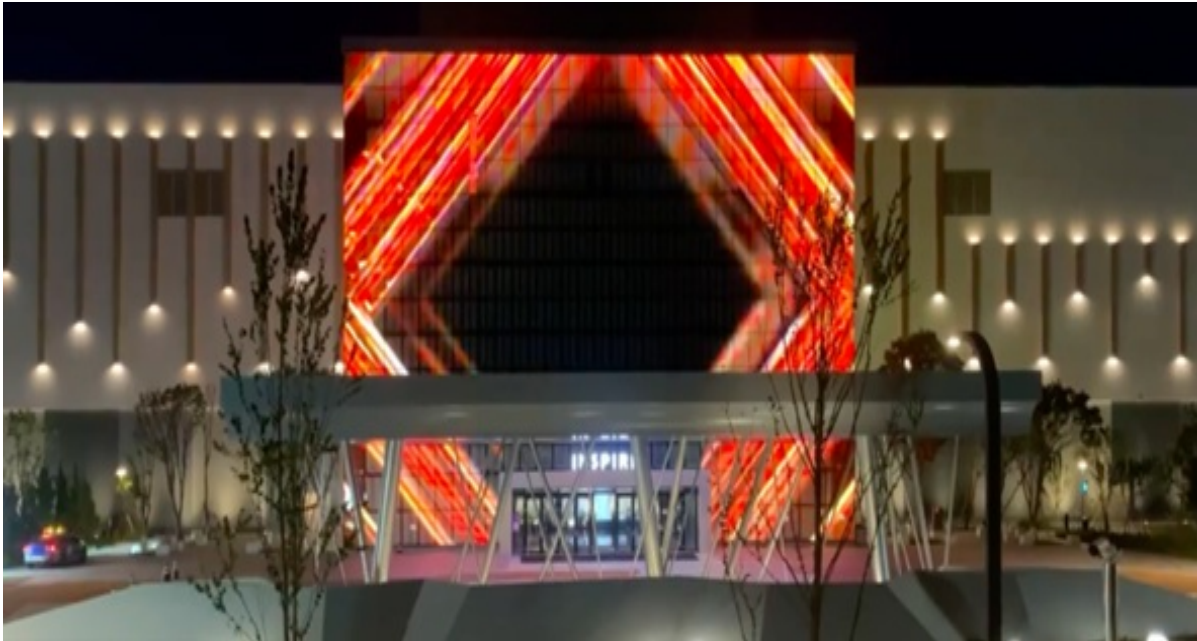
Mohegan INSPIRE Entertainment Resort