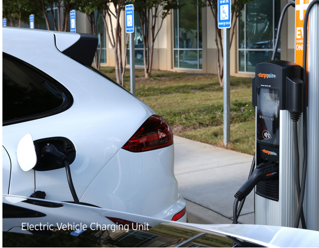
Electric Vehicle Charging Unit