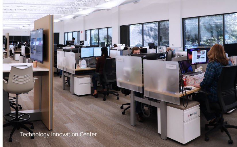
Technology Innovation Center

Research has shown that the physical workspace plays a critical role in fostering digital innovation. To that end, in 2019 the Company opened the Primerica Technology Innovation Center, a renovated 38,000 square foot IT workspace that embraces open spaces, enables collaboration, and avoids conflicts that arise in a personal office hierarchy. Currently housing IT professionals with ample room to accommodate future growth, the cutting-edge workspace includes: