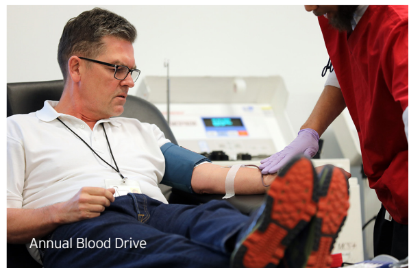
Annual Blood Drive

In response to helping families still recovering from the hardships of the COVID-19 pandemic, Primerica continued to work closely with non-profit and civic leaders to identify and fund the most pressing needs in our community. Priority funding was given to crucial human needs. Our donations went to organizations like the Atlanta