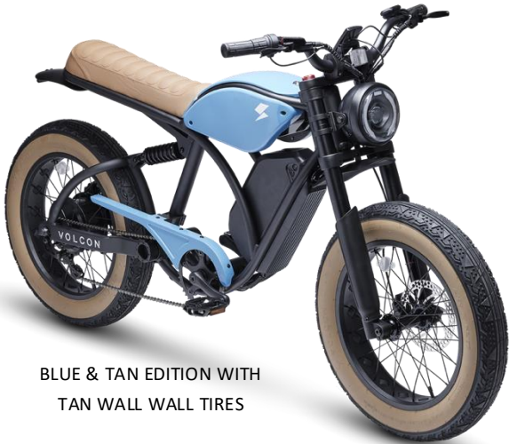
BLUE & TAN EDITION WITH TAN WALL WALL TIRES

DYNAMIC SETTINGS With 4 selectable ride modes, you have the freedom to ride where and how you want. The display provides the rider with battery percentage, a speedometer, max speed, average speed, trip distance, and an odometer.