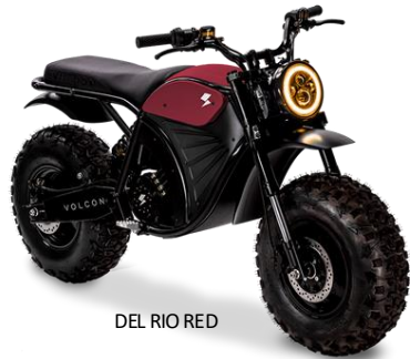
DEL RIO RED

LONG RANGE Cover more territory, and for longer. The optional dual battery setup provides a 60 mile range* and a top speed of 55 mph. Less recharging means more time outdoors. A single-battery setup is also available.