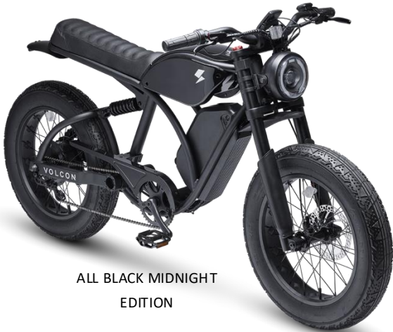
ALL BLACK MIDNIGHT EDITION

PROUDLY CERTIFIED BY UL2271 AND UL2849 (THE GOLD STANDARD OF E-BIKE SAFETY), THE BRAT MEETS RIGOROUS SAFETY STANDARDS. WHEN YOU RIDE THE BRAT YOU CAN BE CONFIDENT THAT YOU'RE ON A MACHINE THAT'S AS SAFE AS IT IS EXHILARATING.