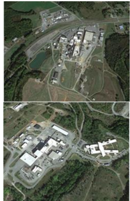
Piedmont Lithium Location and Bessemer City Lithium Processing Plant (FMC, Top Right) and Kings Mountain Lithium Processing Facility (Albemarle, Bottom Right)

The Project was originally explored by Lithium Corporation of America which eventually was acquired by FMC Corporation ("FMC"). FMC and Albemarle Corporation ("Albemarle") both historically mined the lithium bearing spodumene pegmatites within the TSB and developed and operated the two lithium processing facilities in the region which were the first modern spodumene processing facilities in the western world.