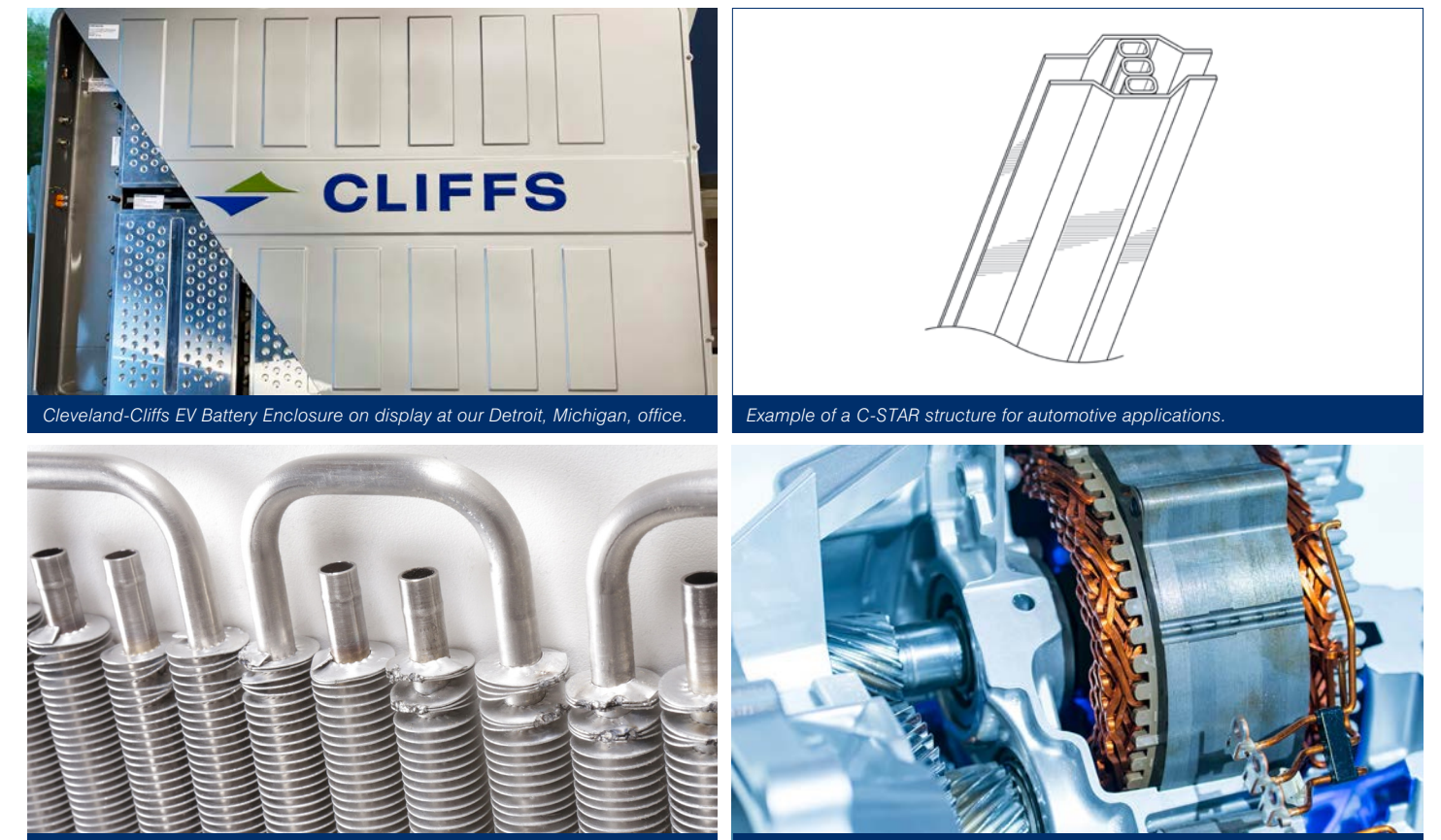
Steel micro cooling components for freezers.