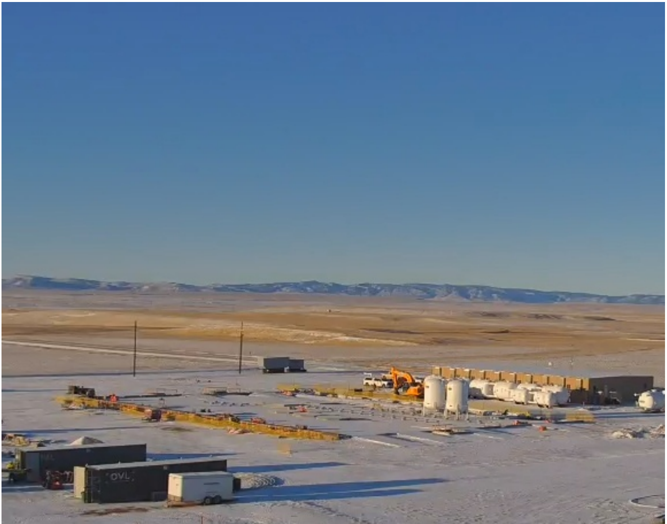
Photo 1. Shirley Basin Satellite ISR Plant Under Construction - October 28, 2025

One of the two evaporation ponds is constructed, with the second pond nearing completion. Once both are fully constructed, work will commence on the installation of liners and technical components.