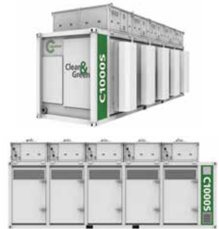
C1000S ICHP Power Package