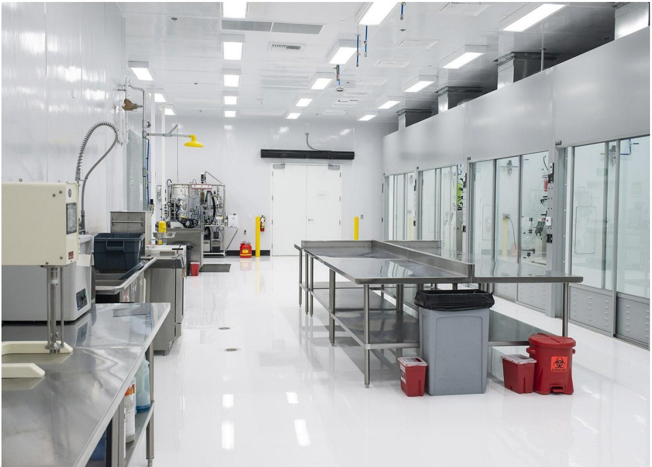
Photo: City Trees production facility, Las Vegas, NV