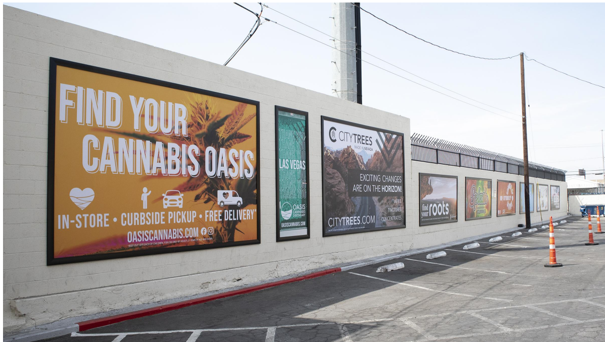
Billboard wall, Oasis Cannabis, Las Vegas NV, 17 September 2020