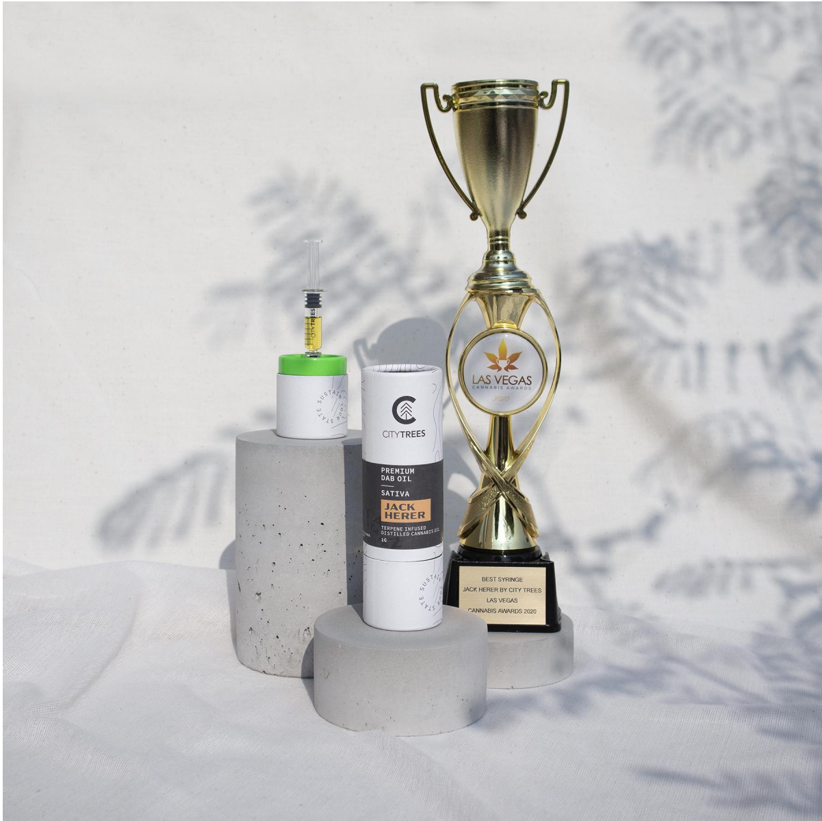
Las Vegas Cannabis Award winning Jack Herer Distillate Oil, 17 September 2020

City Trees was also honored at the Las Vegas Cannabis Awards on September 4, 2020, where it was presented with the first place prize for 'Best Syringe' for its Jack Herer distillate oil. Alongside two prizes in the 2019 High Times Nevada Cannabis Cup, this latest honor is the third industry award for the brand in the last year.