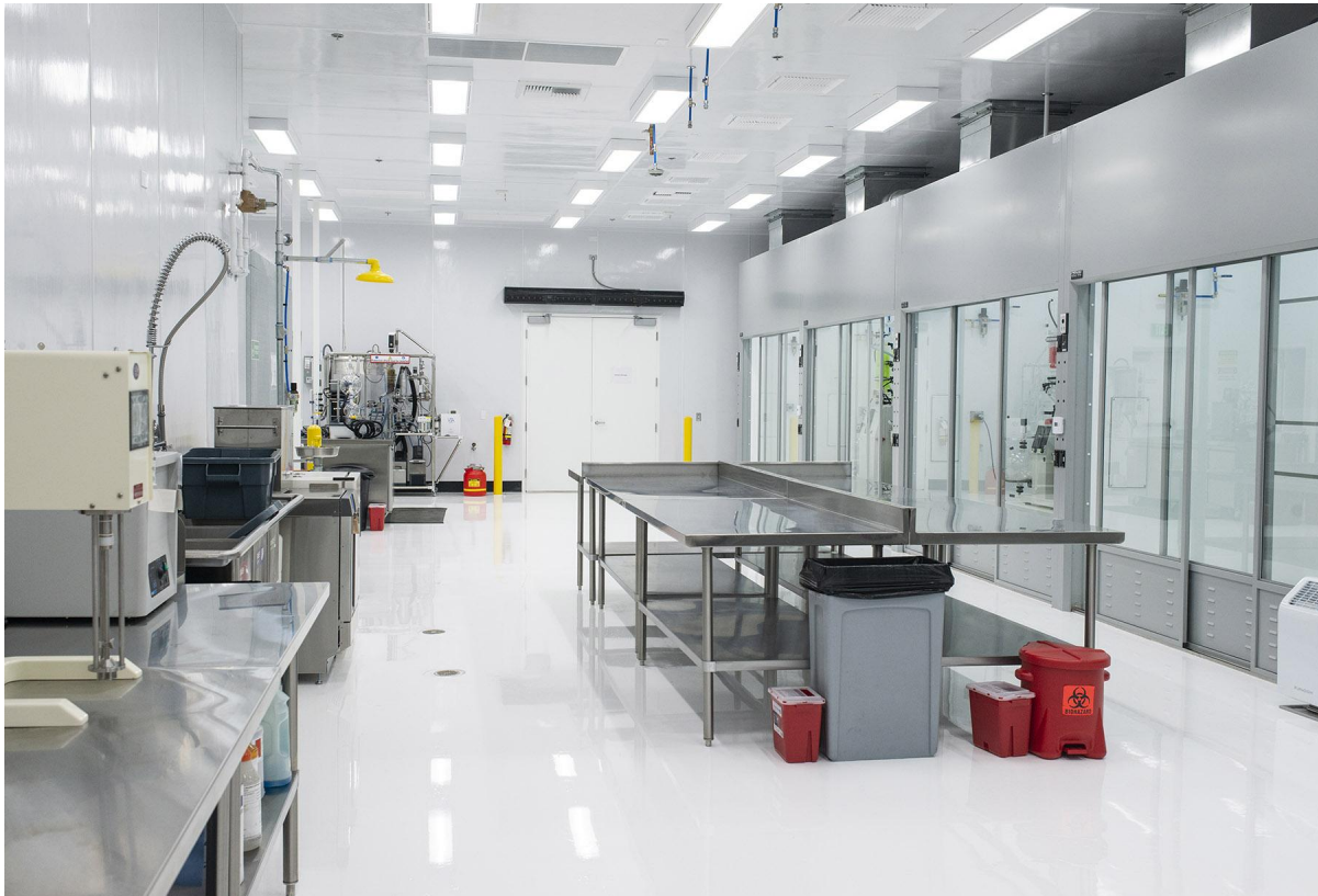
Photo: City Trees production facility, Las Vegas, NV