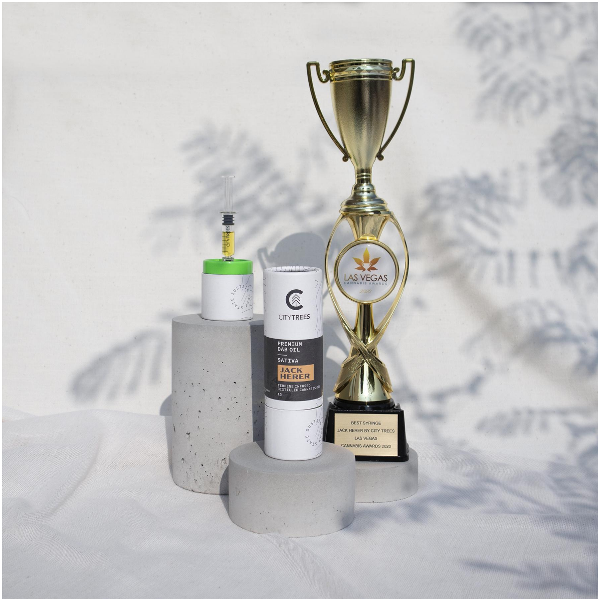
Las Vegas Cannabis Award winning Jack Herer Distillate Oil, 17 September 2020

City Trees was also honored at the Las Vegas Cannabis Awards on September 4, 2020, where it was presented with the first place prize for 'Best Syringe' for its Jack Herer distillate oil. Alongside two prizes in the 2019 High Times Nevada Cannabis Cup, this latest honor is the third industry award for the brand in the last year.