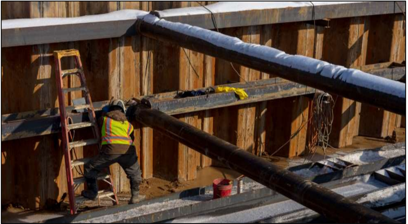
Construction of the Slope Portal to Access Underground Coal