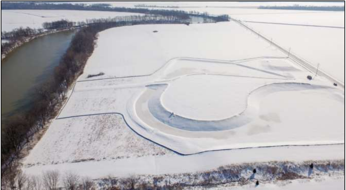
Completed Site Excavation at the Poplar Grove Mine Barge Load-out Facility