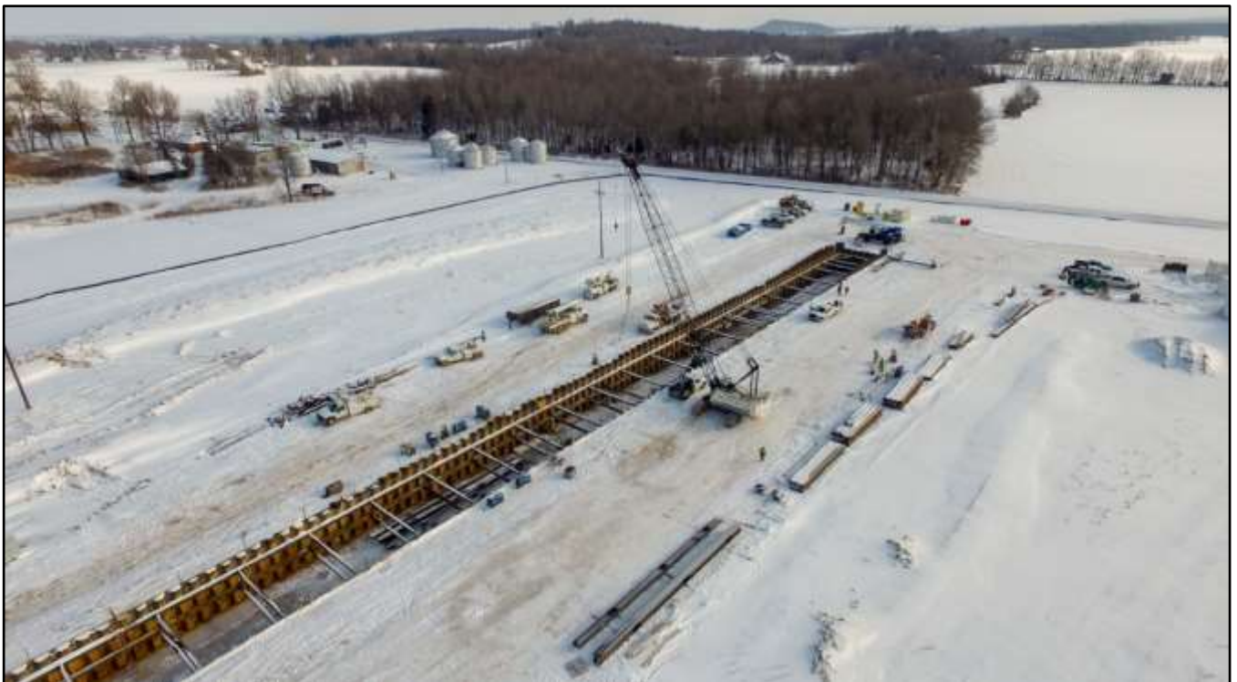
Excavation of the Slope Decline to Access Underground Coal