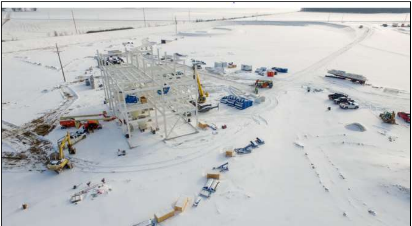
Installation of Internal Coal Processing Infrastructure at the Preparation Plant