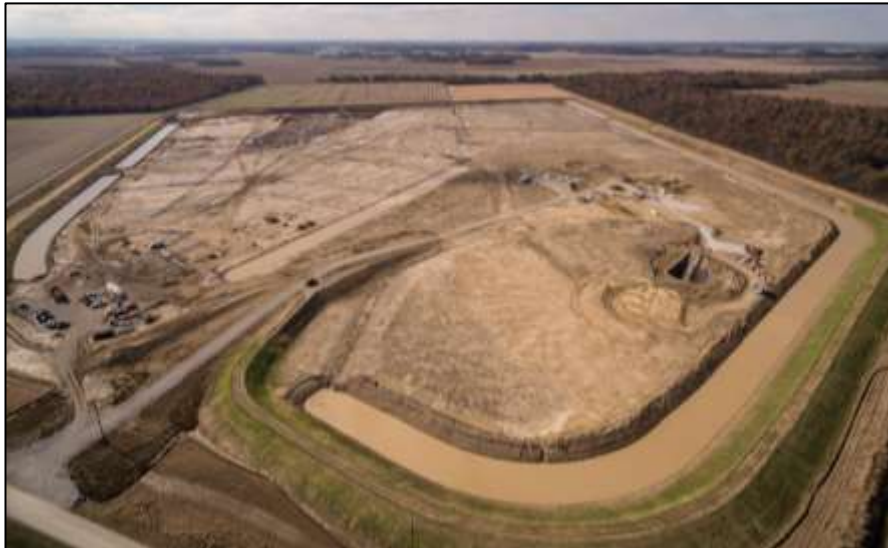
Poplar Grove Mine Site