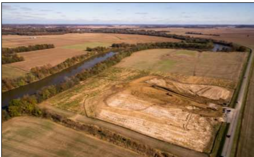
Poplar Grove Barge Load-Out Facility on the Green River