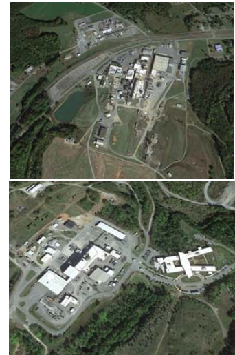
Figures Above: Piedmont Lithium Location and Bessemer City Lithium Processing Plant (FMC, Top Right) and Kings Mountain Lithium Processing Facility (Albemarle, Top Left)

The TSB has previously been described as one of the largest lithium provinces in the world and is located approximately 40 kilometres west of Charlotte, North Carolina, United States. The TSB was the most important lithium producing region in the western world prior to the establishment of the brine operations in Chile in the late 1990’s. The TSB extends over approximately 60 kilometres in length and reaches a maximum width of approximately 1.6 kilometres.