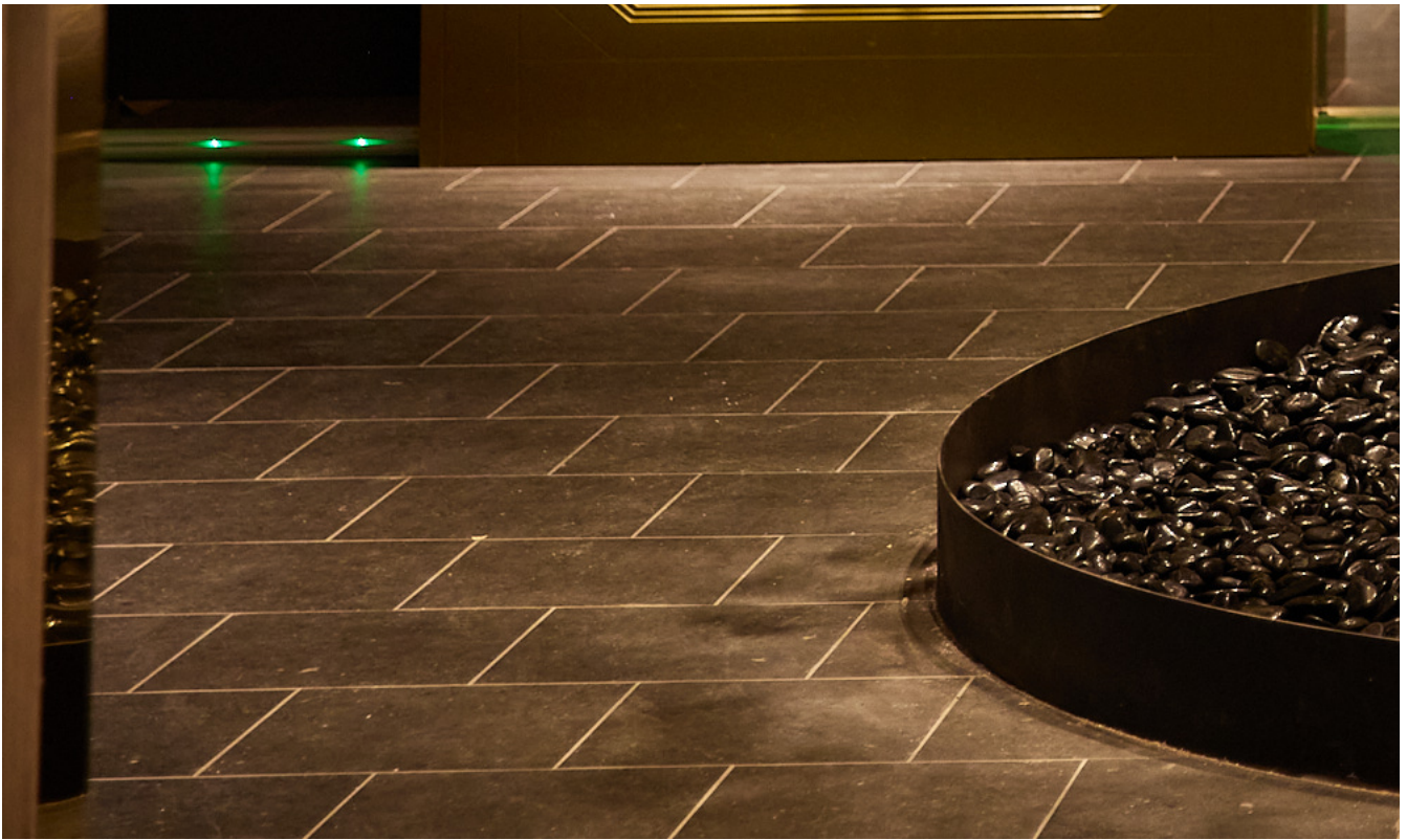
Custom-made bronze and hand-cast glass Bonsai Cherry Tree sculpture outside Pacific Rim