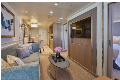
Penthouse Suite Living Room